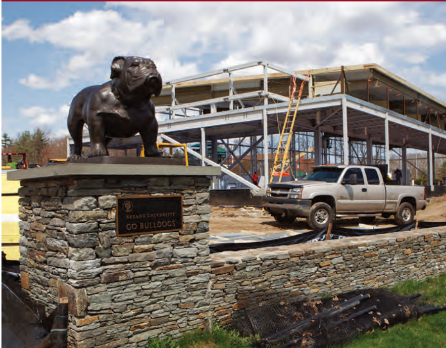
The Bryant Bulldog statues, a gift from the Class of 2009, oversee construction of the new Weight and Conditioning Center in the endzone of Bulldog Stadium.

Bryant is creating innovative domestic and international facilities that inspire excellence. In the next year, we will add more than 250,000 square feet both at the Smithfield campus and in Zhuhai, China. Our design for the future is underway.