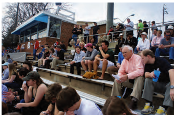
March 10 | Chapel Hill, NC Bryant Men's Lacrosse vs. North Carolina

It was a nail-biting lacrosse game for our Bulldogs in Chapel Hill, NC. Bryant eventually fell 9-10 to the Tar Heels.