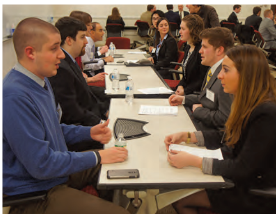
January 13 | Hartford, CT

View more pictures at www.bryant.edu/alumniphotos