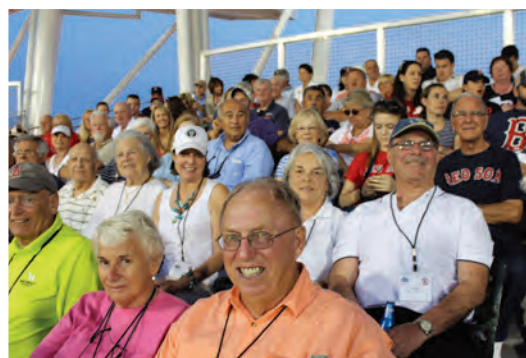
March 13 | Ft. Myers, FL

It was a nail-biting lacrosse game for our Bulldogs in Chapel Hill, NC. Bryant eventually fell 9-10 to the Tar Heels.