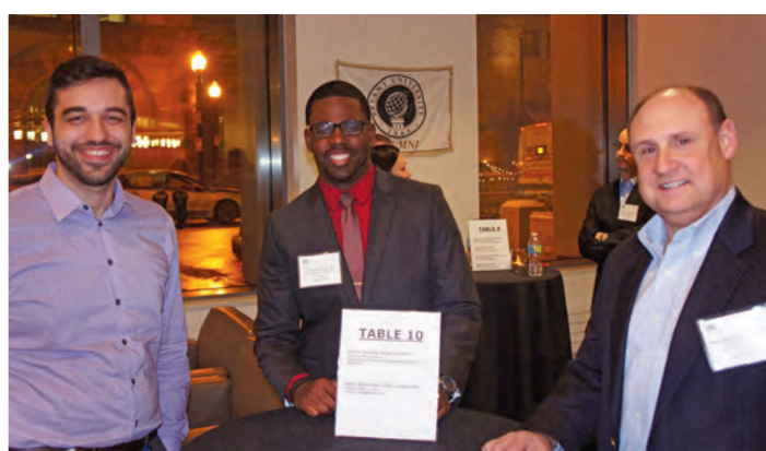
January 15 | Boston, MA

Bryant students had the opportunity to get real-world advice from alumni at the student-alumni career networking event in Hartford.