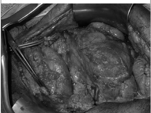
This patient with a history of PD has developed symptoms of intestinal obstruction. At laparotomy there is a clear fibrotic and thickened membrane covering the bowel. There are also extensive adhesions.