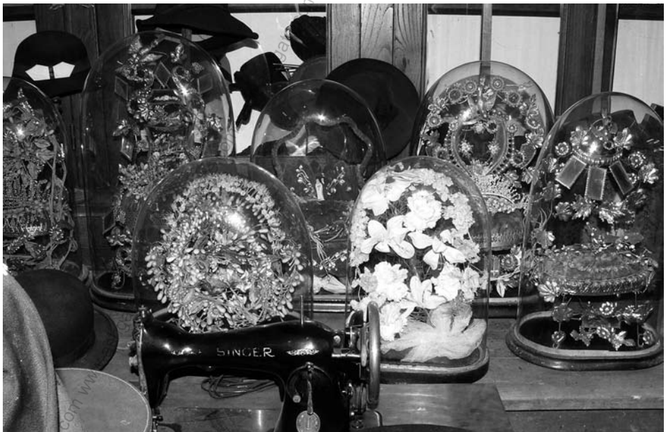
15.5 Marriage Globes, Ecomuseum of Old Trades, Lizio, Brittany. Photographed by the author, May 2008

A third object in the material culture of mourning on Ouessant is the marriage globe: a glass-domed collection of personally significant objects that have a significant presence in many regional museums dedicated to the folkloric and material culture of Brittany (see Figure 15.5). Marriage globes contained a range of symbolic objects that could include a bride's wedding crown, her bridesmaid's bouquets, small mirrors that might (dependent on their shape or placement) represent fidelity, the union of two souls, the number of children