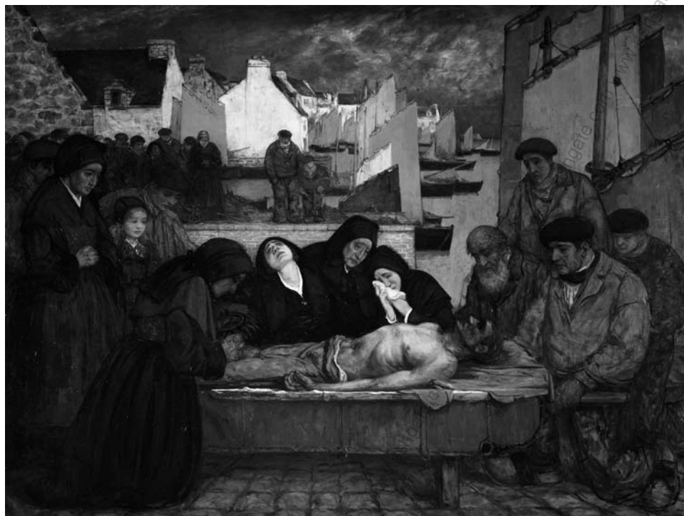
15.4 Charles Cottet, In the Land of the Sea. Grief , also called The Victims of the Sea. Grief , 1908. Oil on canvas, 264 × 345 cm. Musée d'Orsay, Paris. Image in public domain, photograph by Art Resource

Cottet's large-scale painting, Victims of the Sea, Grief (also called In the Land of the Sea. Grief ) (see Figure 15.4), clearly updates the premodern Catholic pieta , setting the scene in a harbor in Brittany (Isle de Sein). Stone calvary groups in this region (fifteenth to seventeenth centuries) similarly group together mourning women around the body of Christ and the lamenting Virgin ( Mater Dolorosa ). Marked by color and divided by gender and proximity of land or water, the crowd at the harbor surrounds a verdigris corpse recently plucked from the sea. Three women in mourning cloaks, dramatically grieving, hover above the corpse: two women in black and a young girl anchor the earthbound side of the composition, while four ages of men stand before red sails on the right. Cottet's earlier Marine Grieving (Royal Museum of Fine Arts, Antwerp, 1903) is a pieta group that lacks a visible body; mourning is a state of mind experienced by all ages of women who suffer loss as child, wife, and mother of the departed (we cannot know it for sure, but the absent mourned body in Cottet's works always seems implicitly male). In her voluminous cloak, the elder widow has a Marian gravity and a corresponding lack of sensual