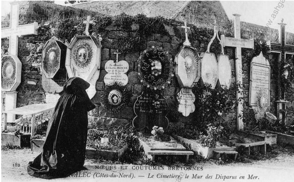
15.1 Ploubazlanec. The Cemetery and the Wall of the Disappeared at Sea. Postcard, circa 1910