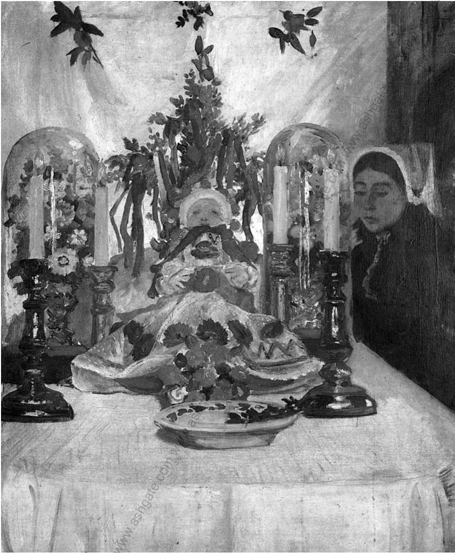
15.6 Charles Cottet, The Dead Child , 1897. Oil on canvas, 65 × 55 cm. Fine Arts Museum, Quimper. Image in public domain, photograph by author