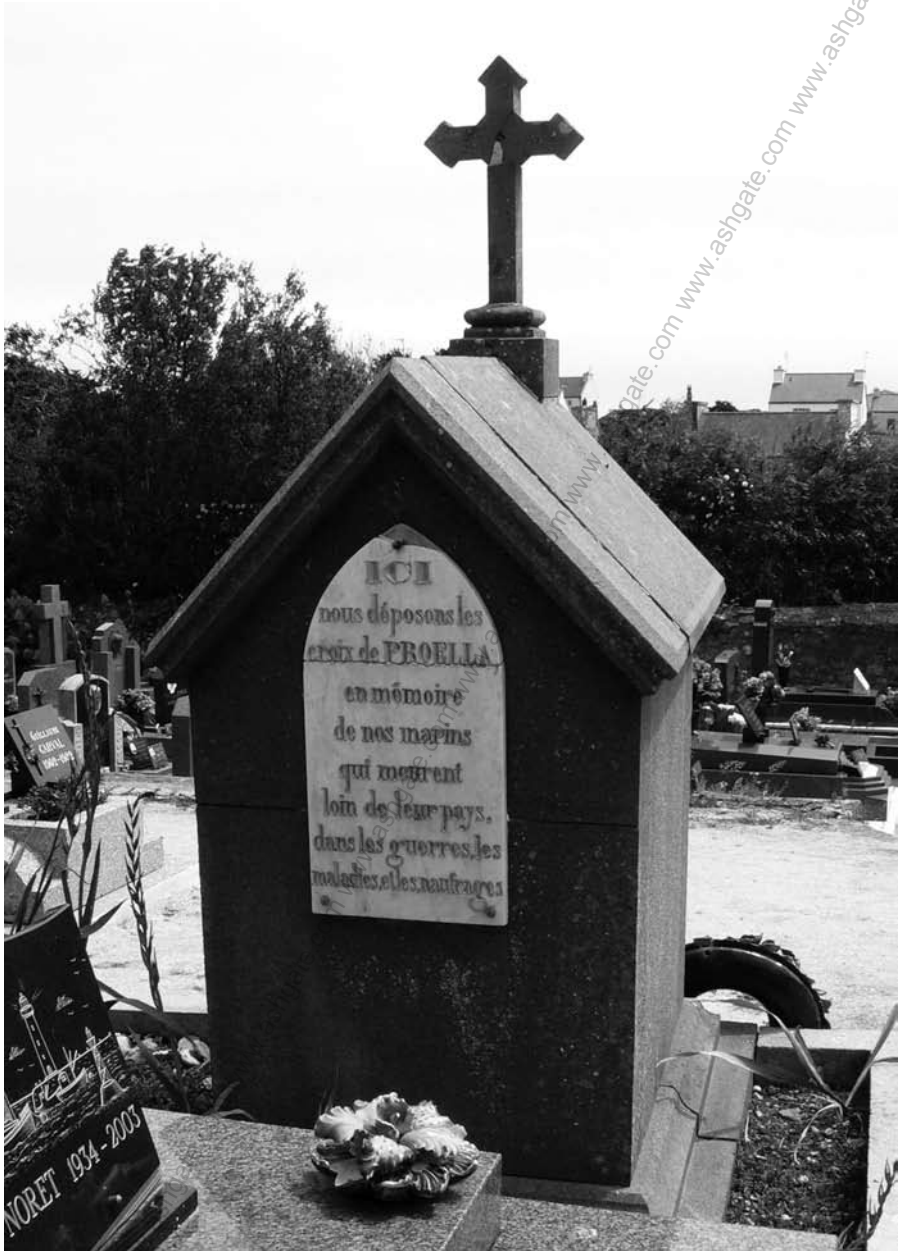
15.3 Proëlla Tomb, Lampaul Cemetery, Ouessant. Photograph by author, summer 2006