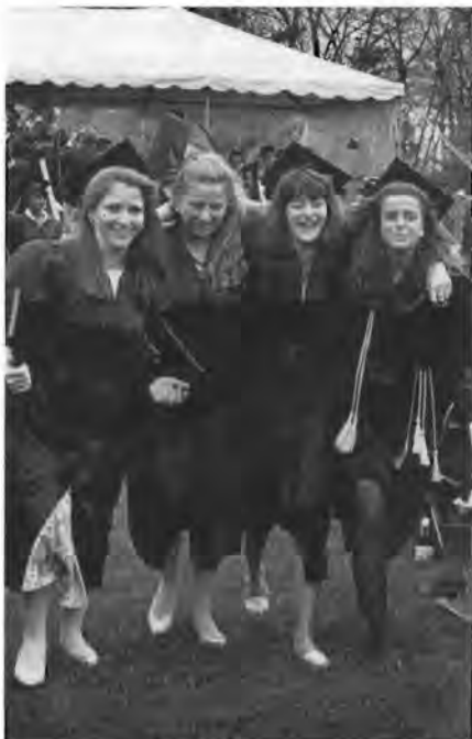
The exhilaration of Commencement is evident on these happy faces.