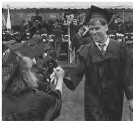
Skies brightened Commencement morning as jubilant graduates congratulated each other on their success.