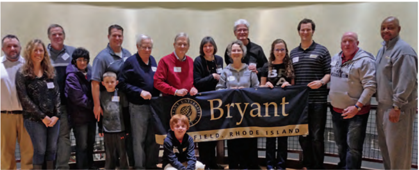
December 11 | Smithfield, RI