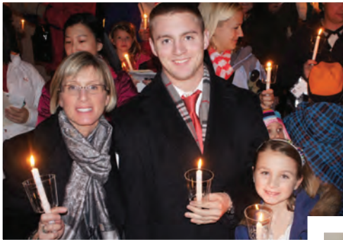
December 11 | Columbus, OH Bryant Bulldogs vs. Ohio State Buckeyes