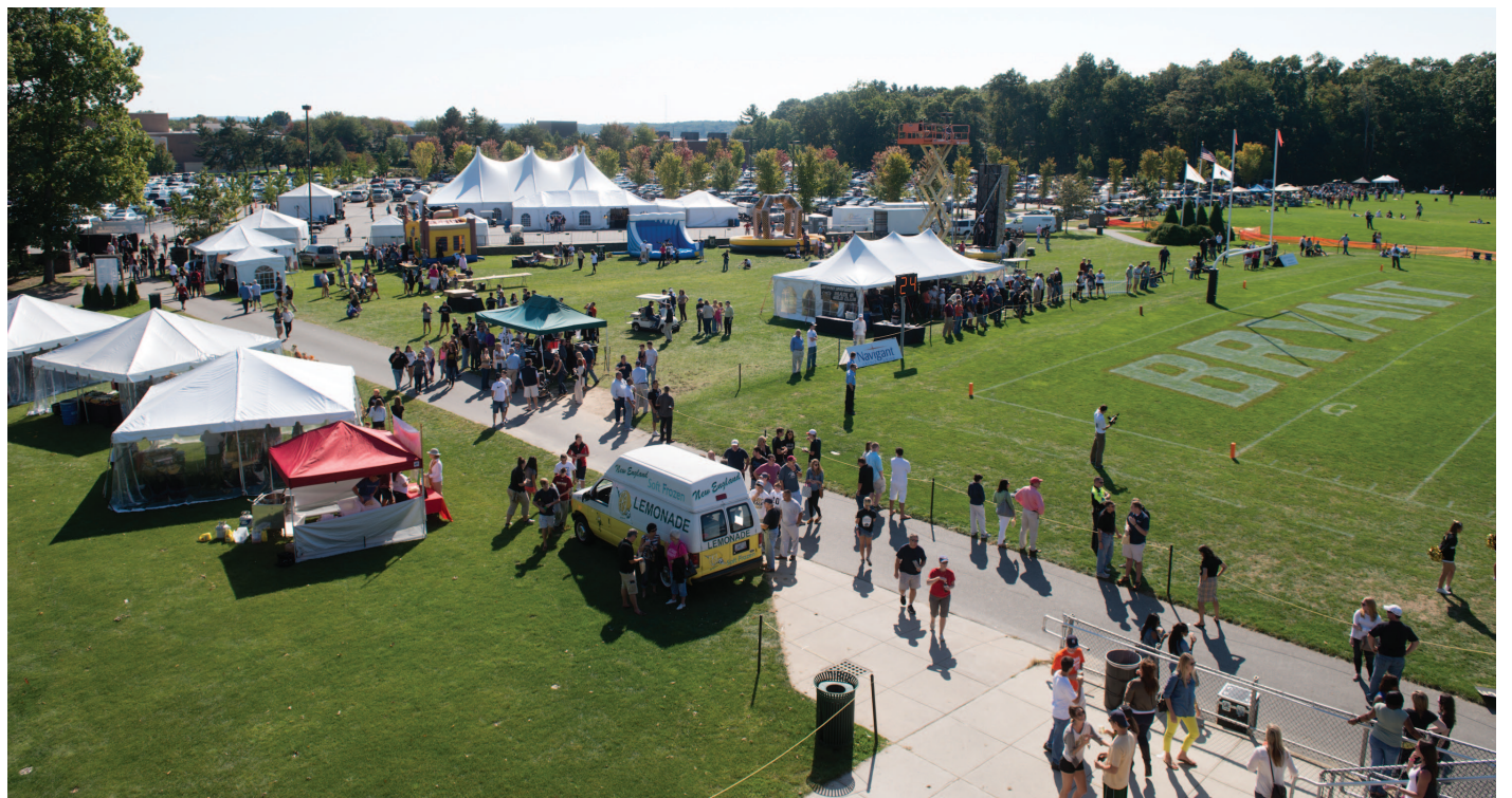
Overview of campus, including Alumni Village (top left to center) during Reunion @ Homecoming.