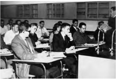
In the early 1960s preparing to seek accreditation, Bryant ramped up its liberal arts course offerings. In 1962, the biology lab consisted of a single wet laboratory work station.