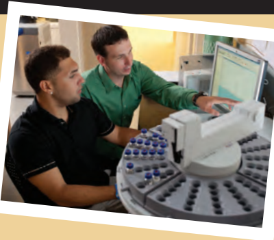
Today, the 8,300-square-foot science complex features two large wet labs, each able to accommodate 24 students, and an advanced wet laboratory, for up to 16 students, plus six individualized research labs.