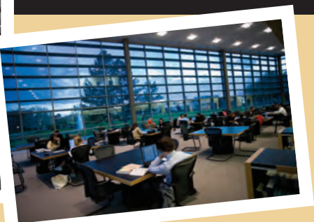
The 62,000-square-foot Douglas ‘69 and Judith Krupp Library was built to accommodate today’s group- or cohort-oriented learning model. Today’s library has 446 seats and nearly five miles of shelves.

View more pictures at www.bryant.edu/alumniphotos