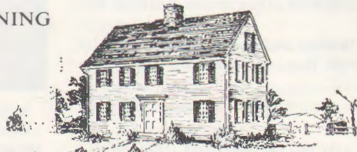
CAPT. JOSEPH MOWRY HOUSE ALUMNI CENTER