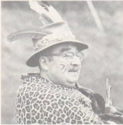
"Leading the tribe of Indian boosters was a favorite occupation . . ."