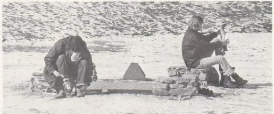
When the pond in front of the Unistructure freezes there's skating.