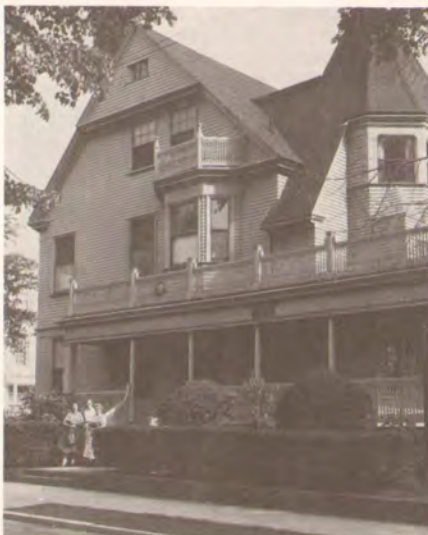
Stowell House as it looked on the old campus.