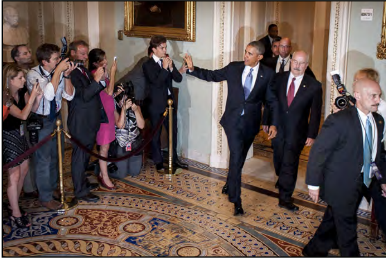
President Barack Obama arrives at the U.S. Capitol for meetings concerning the situation in Syria on Tuesday, September 10, 2013, in Washington D.C.

Now the United States and our President stand at a crossroad. Do we have utilize our military force and strike Syria for this awful attack, or do we stay out in let the civil war unfold. Personally it's hard to find a right answer, yes this has been an awful war and it needs to end, but a few missile strikes on a couple of locations will not end this awful bloodshed. The answer is no, the United States does not need to be the world's policeman, especially after everything we have experienced in the Middle East. Our country cannot afford risk being sucked into another war, and we also cannot use military force every time a moral wrongdoing is committed. The situation in Syria is awful, and so are the images but currently it is not the United States position to act.