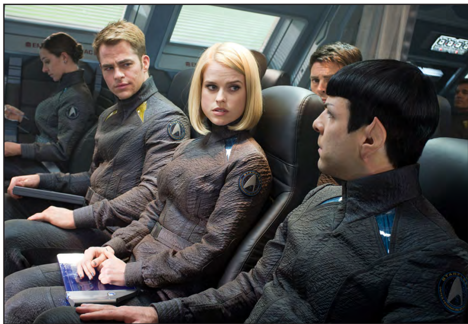
A scene from Star Trek: Into Darkness