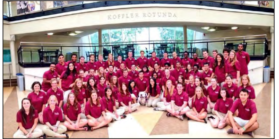
Bryant University Resident Assistants 2013-2014 (Residence Life)

While all RAs put on programs for their residents, it is especially important for freshman residents to attend these. Programs are put on as a way for you to get to know your floormates/suitemates better. Sometimes they are just a social event like a pizza party or some kind of game to get residents mingling, but other times they are aimed to help you become a more successful person by promoting healthy study habits or explaining LinkedIn, just as a few examples. So go to those programs! You never know who you might meet.