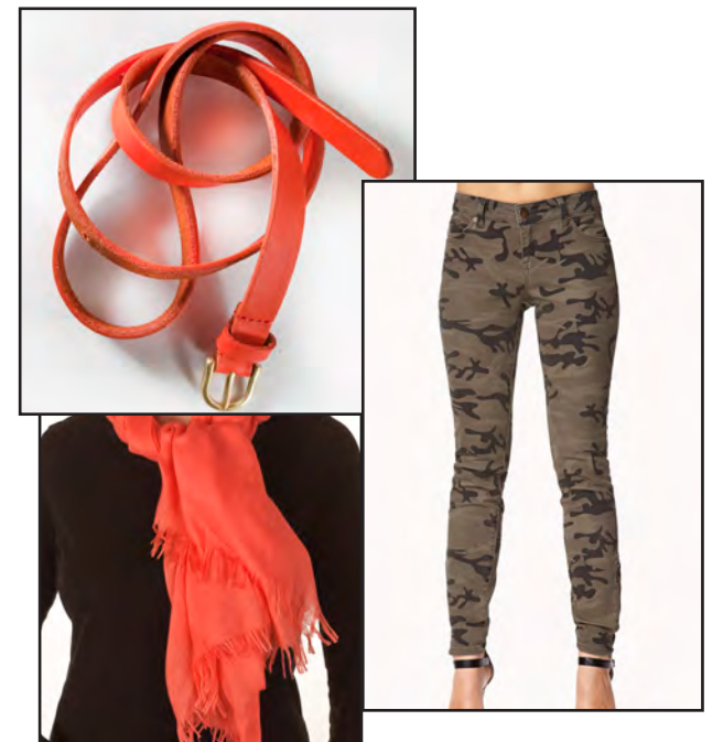
Patterned pants and bold-colored accessories are essential this fall.

The weather may be cold, but the fashion has never been hotter. Recycling old trends while incorporating the new will keep your outfits fresh and stylish. With many combinations to choose from, have fun choosing your fall outfits; after all, tis' the season for fabulous fashion.