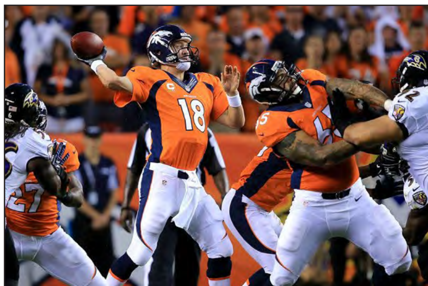
Broncos quarterback Peyton Manning tossed seven touchdowns against the Ravens.

6. Chip Kelly's offense in Philadelphia could really change the NFL: In his first game at the professional level, coach Chip Kelly and the Philadelphia Eagles spoiled Robert Griffin III's return on Monday night with a 33-27