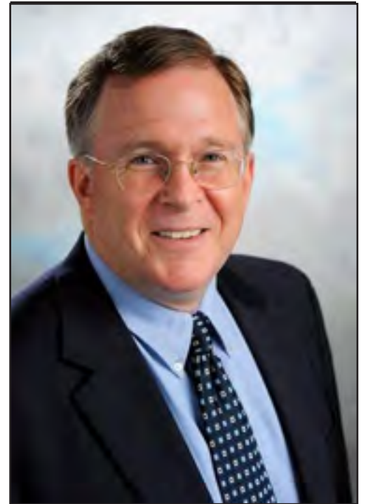
See "Vice President of Student Affairs," page 5.