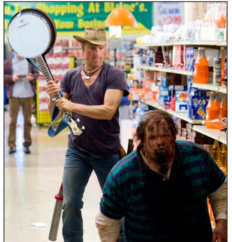
Woody Harrelson in Zombieland.

I will see any movie with James or Dave Franco in it. I just love them; the Francos are my weakness. There are only one or two movies I haven't seen with either of these brothers in them, but I'm working on it. Fortunately, between Dave