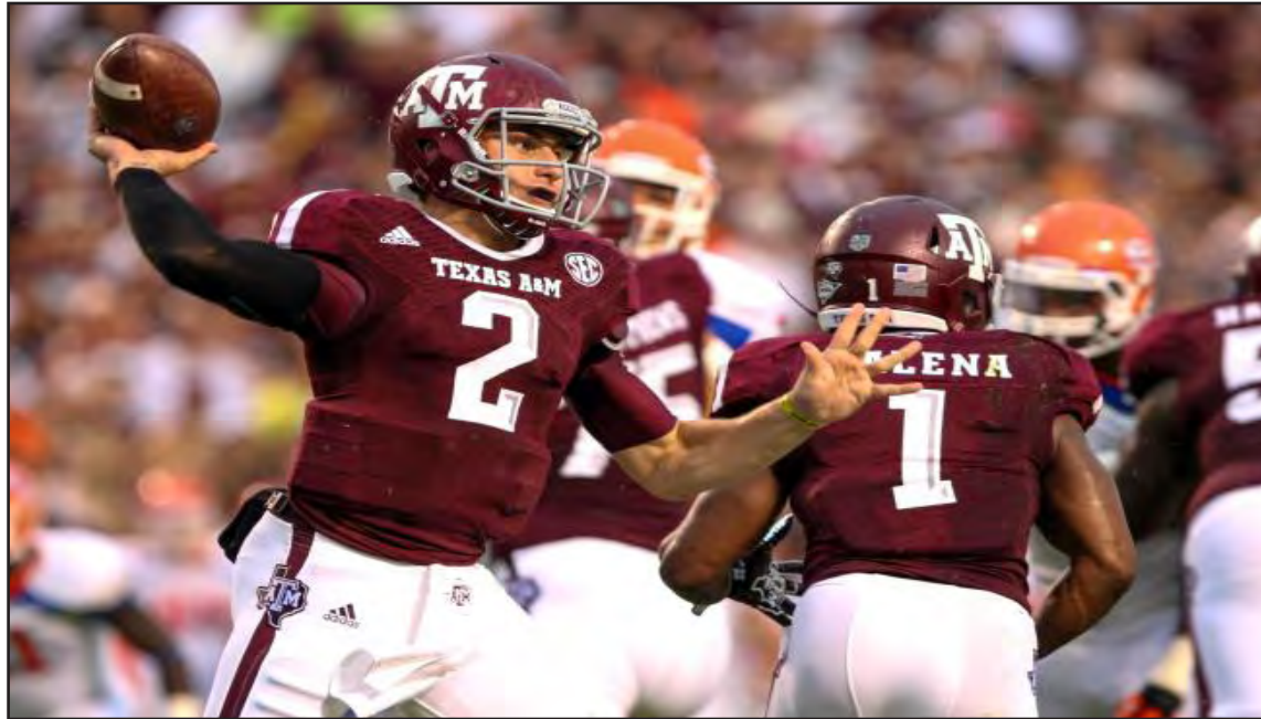
Despite a suspension, quarterback Johnny Manziel is still in the Heisman race early