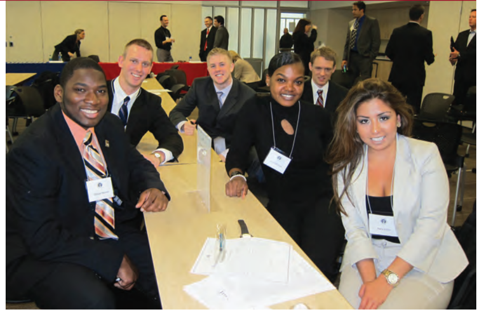
Bryant students in the 2013 Northeast Intercollegiate Sales Competition (NISC) attended valuable skill- and leadership-building sessions.

The Marketing Analytics Minor is designed to give students the conceptual background and applied tools necessary to conduct analysis of databases of markets, consumers, or products, the results of which would be used to drive decision making in organizations. Business and policy decisions are increasingly driven 'by the numbers.' Marketing decision