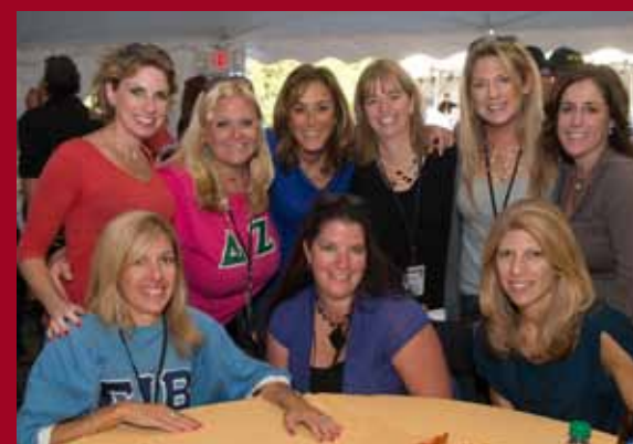
Delta Zeta alumnae