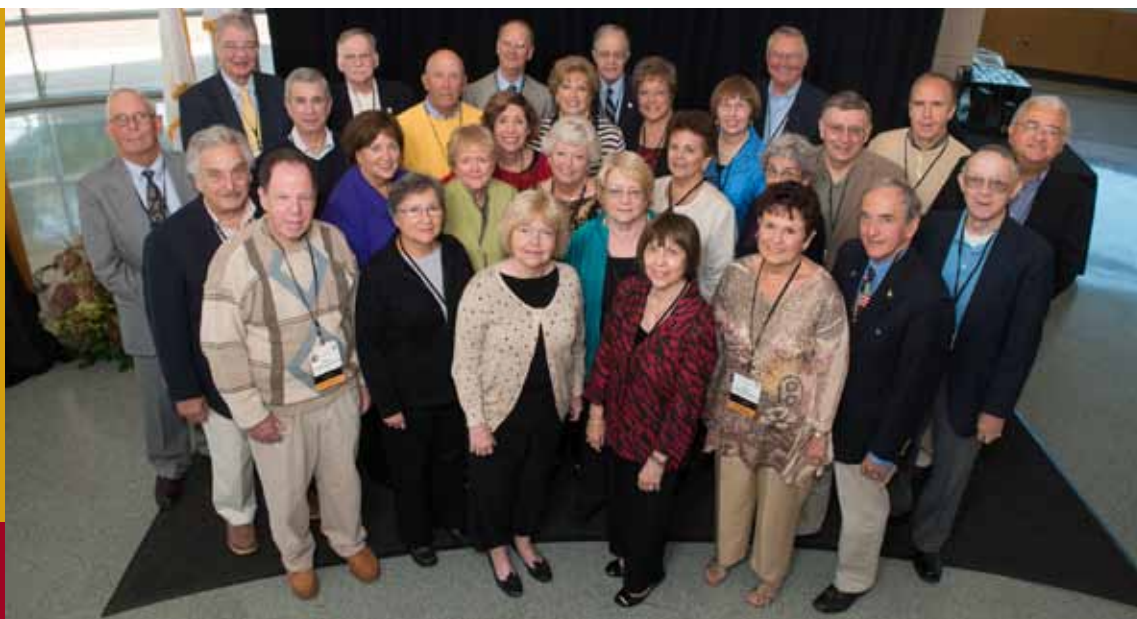
Members of the Class of 1962 inducted into the Loyal Guard

Reunion is scheduled for October 11-13, 2013 during Bryant's celebration of its 150th year as an institution!