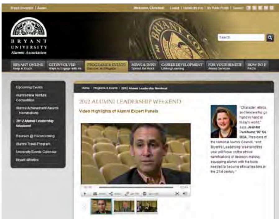
The new alumni website is more dynamic, with videos and tools to help you network.

What gives you access to Bryant's worldwide network of 40,000 alumni – in a secure, password protected environment? Not Facebook, and not even LinkedIn. Welcome to Bryant's newest alumni tool, the iModules online community.