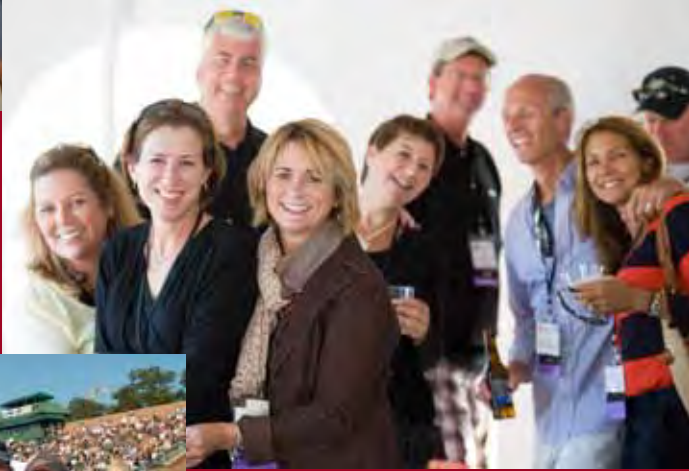
Some members of the 30th Reunion Class of 1982