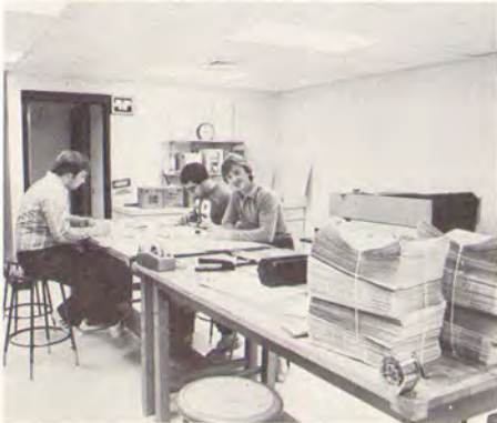
Archway production in progress.