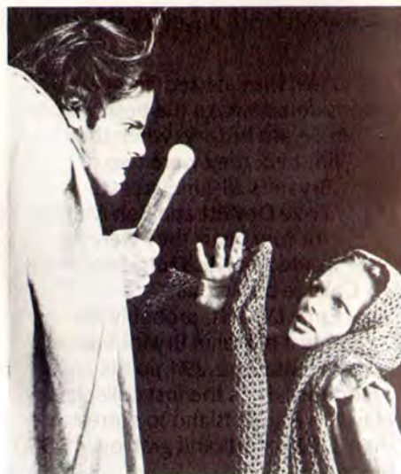
The Chamber Repertory Theatre performs "Seeking Dr. Jekyll" on March 24 as part of the Bryant Performing Arts Series. The series concludes on May 4 at 8 p.m. with a performance of "The Tempest" by the Boston Shakespeare Company. Call 401-231-1200 x328 for information.