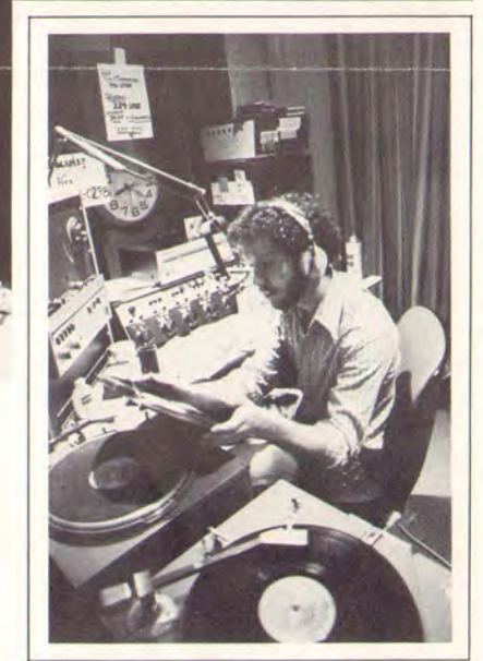
Campus radio station WJMF on the air from the MAC.

Another highlight of the MAC is its unique energy system. "The Stand Alone Energy Management System," produced by Andover Controls in Massachusetts, is designed with an energy-saving heating, cooling and lighting system. So students can play racquetball and be energy-efficient at the same time!