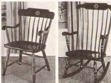
Arm Chair $78 Boston Rocker $62 Delivered at the College

Bryant College Box 12 Smithfield, RI 02917