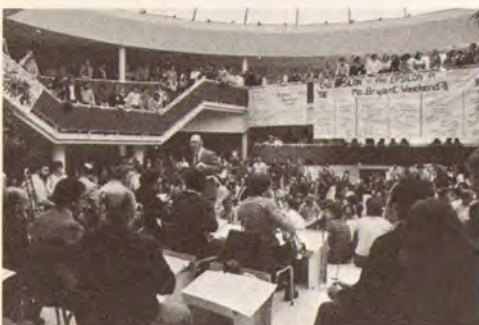
"Doc" Fischman strikes up the band at this year's Jazz Festival (see article, page 1).

Second Class Postage Pending at Providence, RI