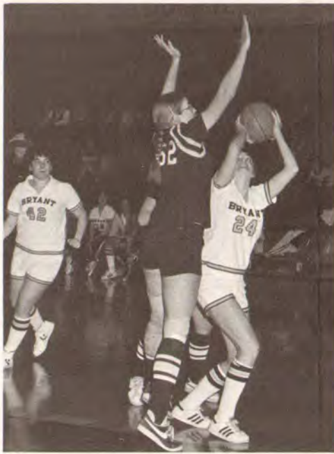
Women hoopsters fight for first winning season.