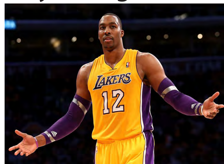
So far, Center Dwight Howard has not worked in the Laker's offense

The last major storyline of the first half is the emergence of Rockets' guard James Harden. Harden was a major player on the Thunder for the past few seasons and really developed an impeccable bond with Russell Westbrook and Kevin Durant. The three of them were often dubbed as "The Big 3" of the Thunder. They often referred to themselves as "brotherhood" and often spoke about how they felt they had built a strong