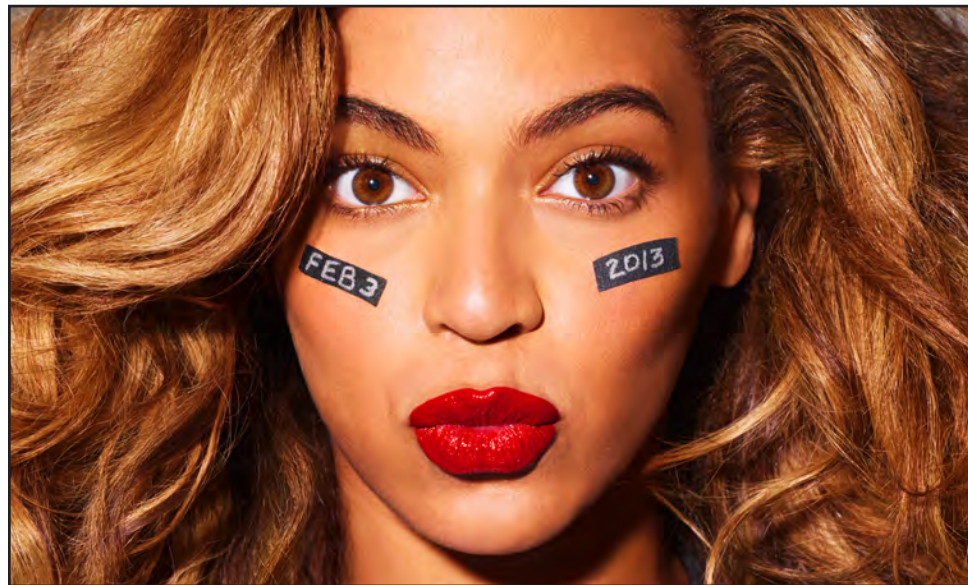
A promo photo for Beyonce's Superbowl performance.

Having played it safe for the past couple of years since Janet Jackson famously flashed millions of unsuspecting viewers at the 2004 Super Bowl, the NFL finally found the perfect balance this year with a fabulous performance by the much-loved Beyonce. Following in the footsteps of legendary performers Aerosmith, Diana Ross, U2, and many others, Beyonce continued to uphold the reputation of fantastic Super Bowl halftime shows. Delivering an exciting and upbeat performance, Beyonce flawlessly embodied the ideal half time performer.