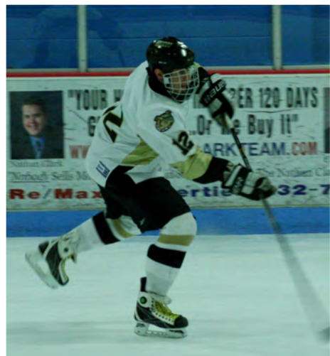
Bryant hockey looks to carry their momentum into the postseason

The Bryant Club Hockey Team had one of the most phenomenal regular seasons in the school's history. At the end of the first half of the regular season, the Bulldogs had a mediocre 6-6-0 record and looked nothing like the team they started off the season as. Going into