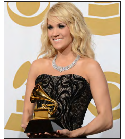
Carrie Underwood

Ocean's "Channel Orange" captured urban contemporary albums. He picked up another award for his role in writing