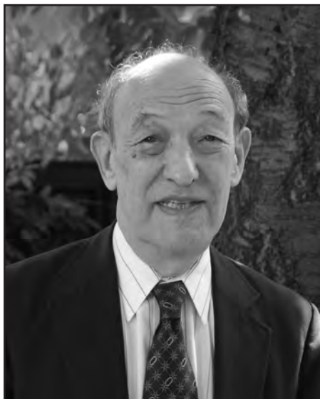
Ezra F. Vogel, Ph.D. spoke on campus on February 7th.

In December of 1978, Deng took power for the first time as China's leader. Deng established the first ever meeting with Japan in the same year. The relationship between the two neighboring countries was severely damaged due