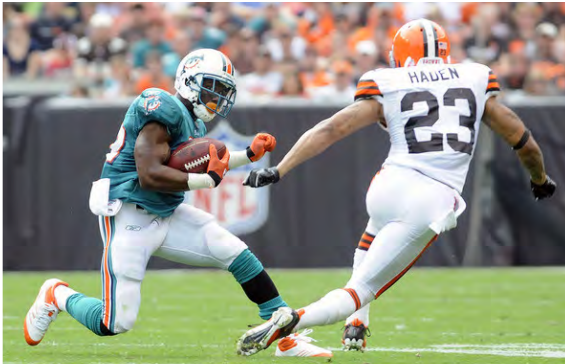
Reggie Bush is one of many NFL stars to hit free agency

4. Wide Receiver Greg Jennings: Jennings was once considered the best receiver in a Packer uniform. Unfortunately, injuries plagued Jennings' 2012 season, and he watched fellow