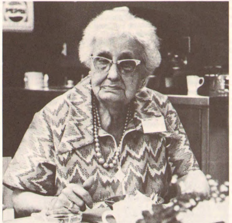
Photos of the Old Guard Luncheon tell a story in themselves ...