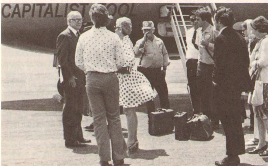
Malcolm Forbes (above), and his party of three, arrived at T.F. Green Airport, Warwick aboard his own gold DC-9 jet.