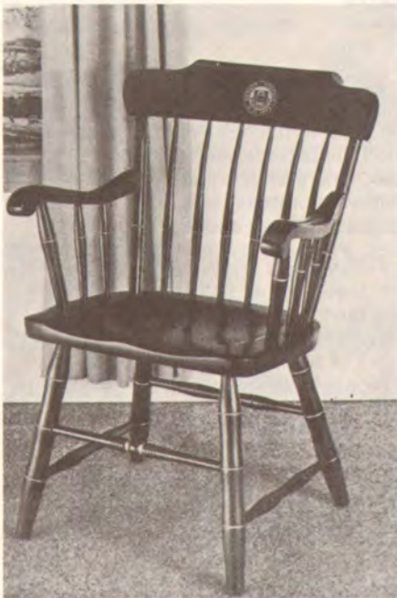
Arm Chair — $70 Delivered at the College

One of the most welcome gifts to a graduate is an Alumni Chair. The distinctive colonial design adds a touch of elegance to any home or office.