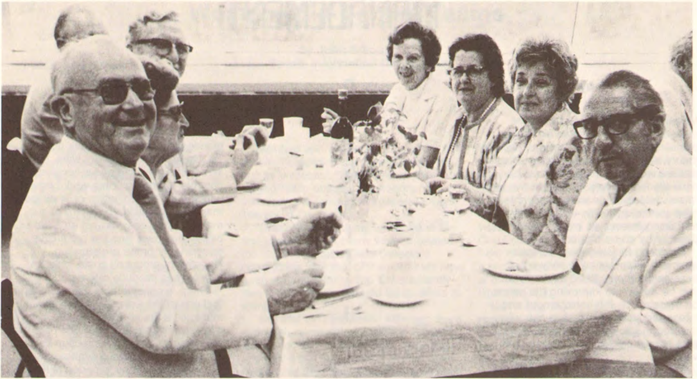
Class of '31