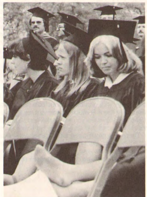
Hot weather led to cool feet.