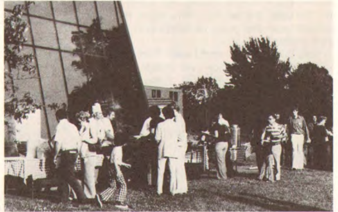
For the Hoe Down (above) the food and drink were located outside Salmanson Dining Hall. Inside, the alumni and their families dined on checkered tablecloths.