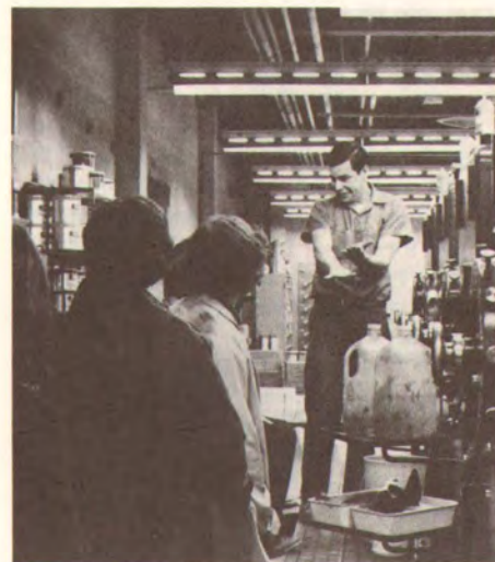
Pressman (above) explains a four-color press. You have to get close with a glass (bottom left) to check the color separation. Sales rep. orientates the class.

After the field trip the class devoted a session to recapping with their classmates what they observed and learned.