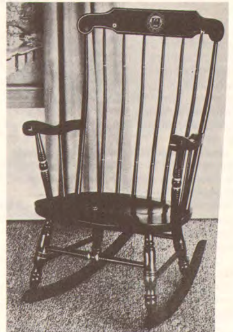
Boston Rocker — $55 Delivered at the College

Place your order anytime during the year by sending a check to the Bryant College, Box 12, Smithfield, RI 02917.