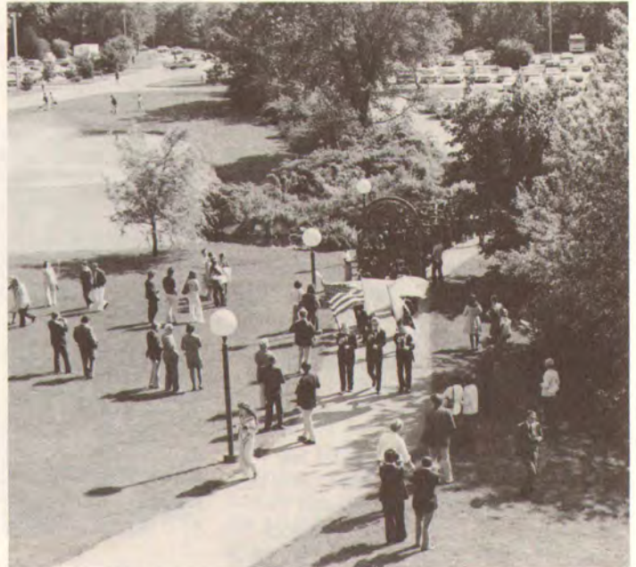
Flag bearers (above) and candidates for degrees marched through the gate on the way to the track. The two young women are trying to find their friends.