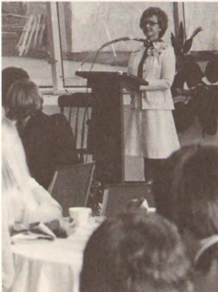
Seniors and alumni (below) get to know each other.