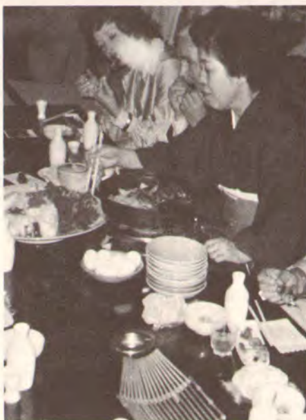
Alumni dining in Japan.

which provided us with the main points of interest. We managed to see the University of Mexico, Zocalo, Pyramids, Shrine of Our Lady of Guadalupe, Chapultepec Park, Xochimilco Gardens and more. We also saw a bullfight in the world's largest bullring.