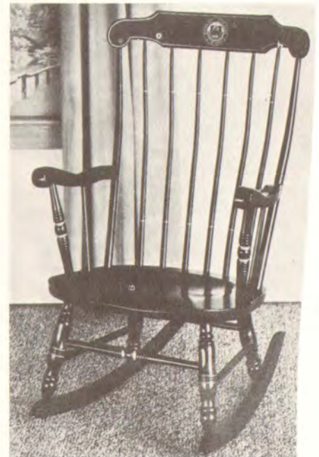
Boston Rocker — $55 Delivered at the College

Place your order anytime during the year by sending a check to the Bryant College, Box 14, Smithfield, RI 02917.