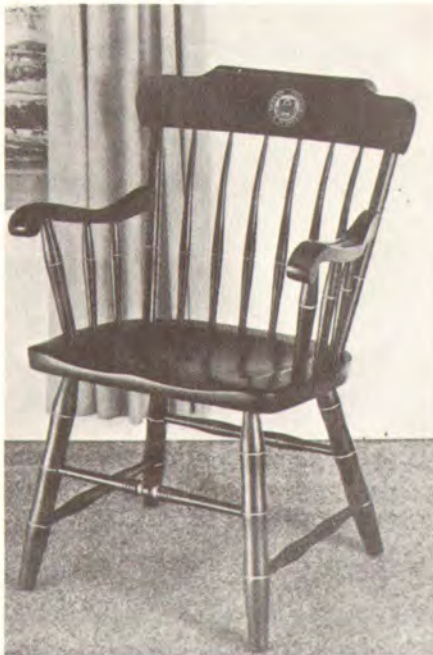
Arm Chair — $70 Delivered at the College

One of the most welcome gifts to a graduate is an Alumni Chair. The distinctive colonial design adds a touch of elegance to any home or office.