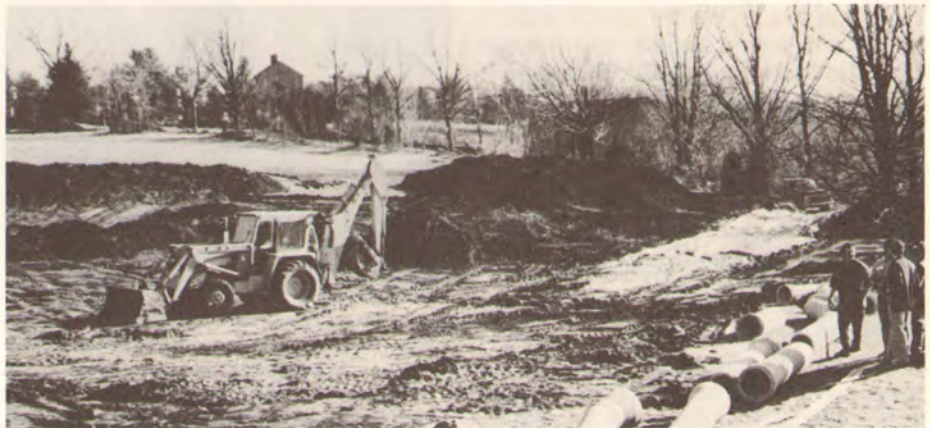
The Student Center, a mudhole now, but by September it will look like this...