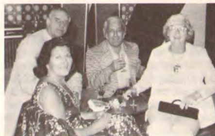
Alumni foursome having cocktails in Mexico.

Where else in one week could you visit a land of sharp contrasts; miles of Pacific coastline alternating with towering mountains. Culture is also a mixture of simplicity and sophistication, a blend of formal and festive.