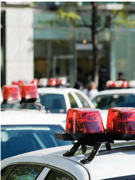
Law Enforcement and Criminal Justice, popular in the 1970s and 1980s, are just two former Bryant majors that form a base for current programs.