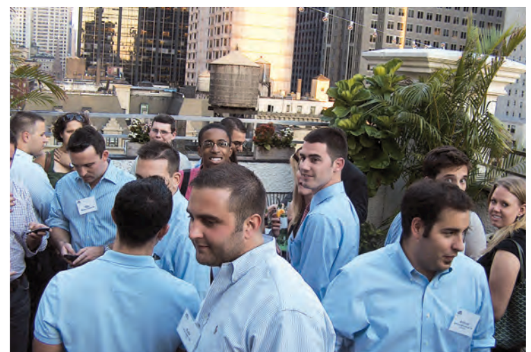
August 26 – Standing room only at the well attended AVA Garden Rooftop Reception in Manhattan, NY. The abundance of blue shirts was a coincidence – not a requirement.