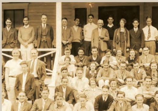
1. In the mid-thirties, Bryant students hailed from 36 states and several foreign countries. Though the number states represented by students remains about the same, Bryant's push for internationalization and diversity in its student body has resulted in students from 54 countries coming to the University.