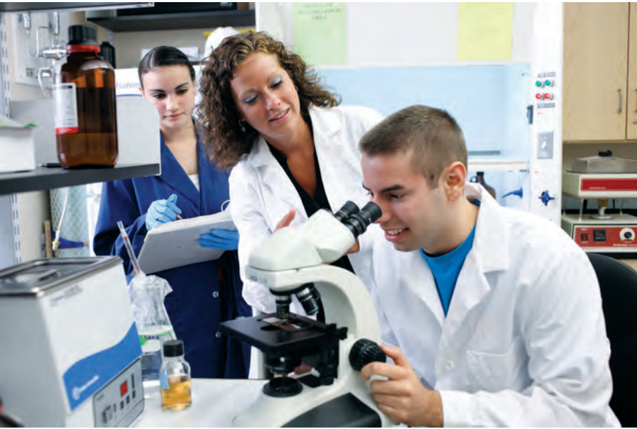
Biology as a major and minor are timely additions as the world is poised on the precipice of unprecedented biological and technical innovation.