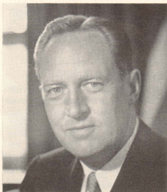
HON. WILLIAM P. ROGERS, Deputy Attorney General, United States Department of Justice (Doctor of Laws).