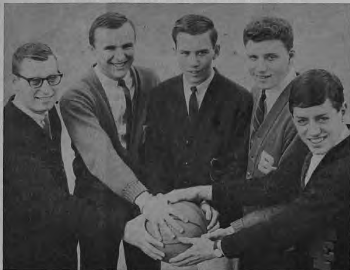
(Archway photo by Jim Herens)