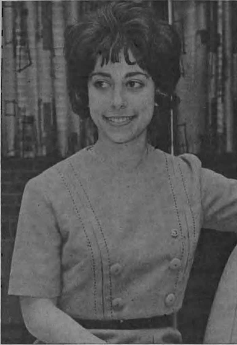
(Archway photo by Jim Herens)