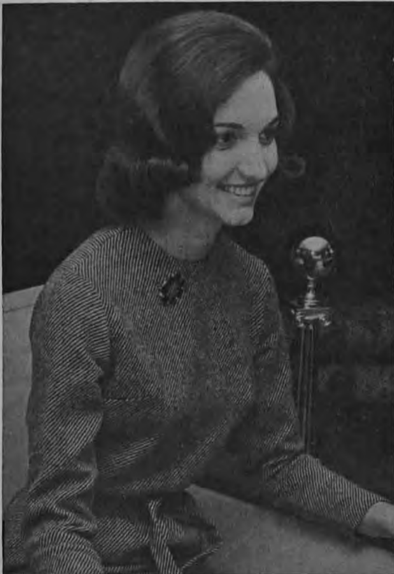
(Archway photo by Jim Herens)