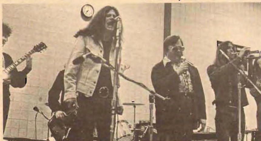
Swallow entertains concert fans in Bryant Gymnasium