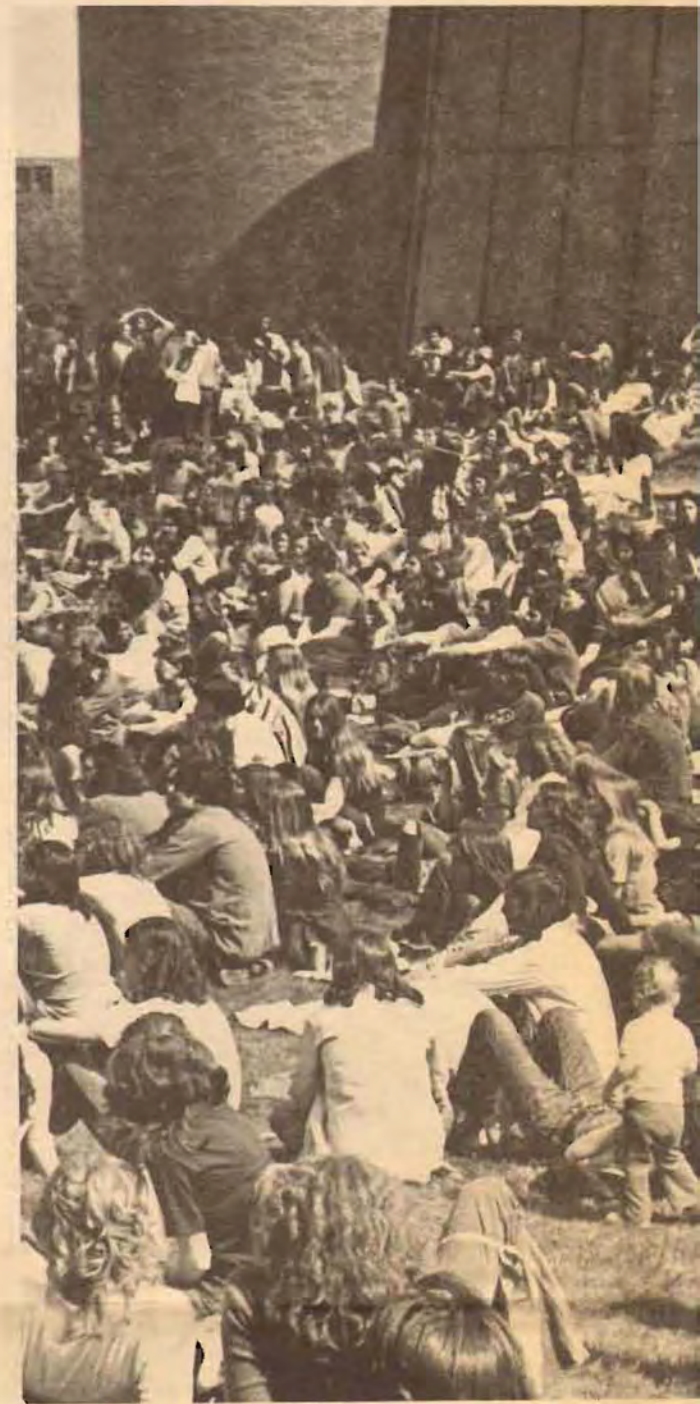
In the shadow of the reflection of the American concert. Donations were asked for the Rhode Island C