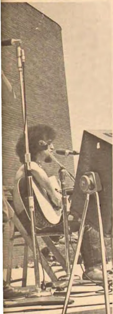
n. "Fist Through a Wall." an