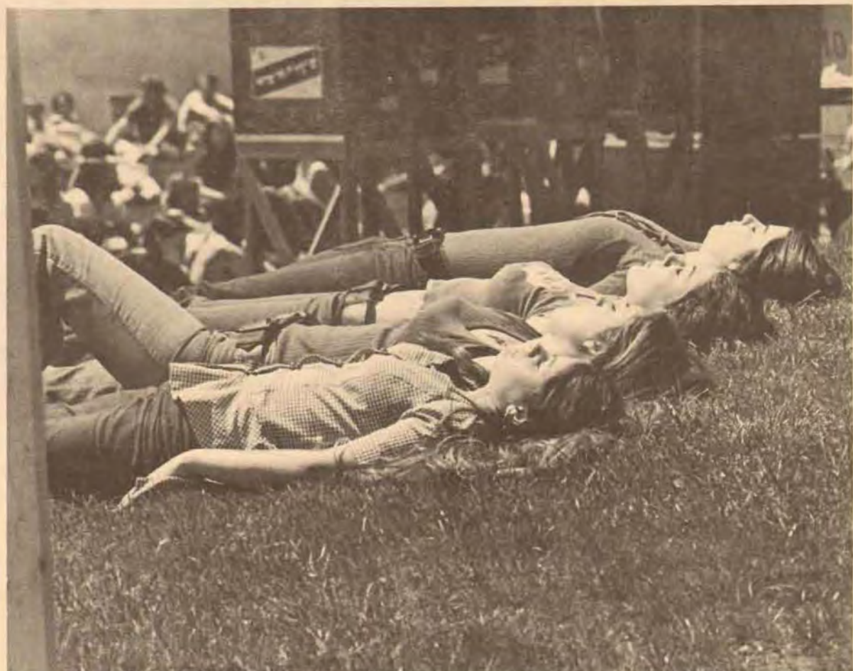
Four pretty young coeds rest on the green, away from the crowd, and enjoy the sweet strains of music.