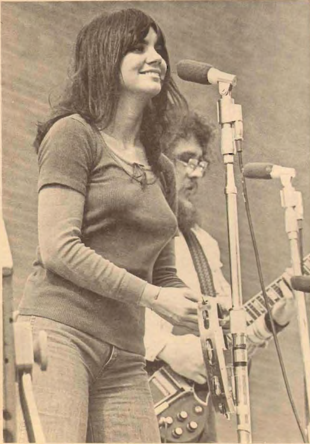
Linda Ronstadt shows her pleasure as the crowd enjoys her hit gold sound, "Long Long Time."