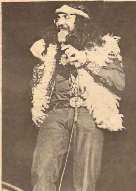
Chong employs body language as a mode expression to add to his biting satirical comedy.