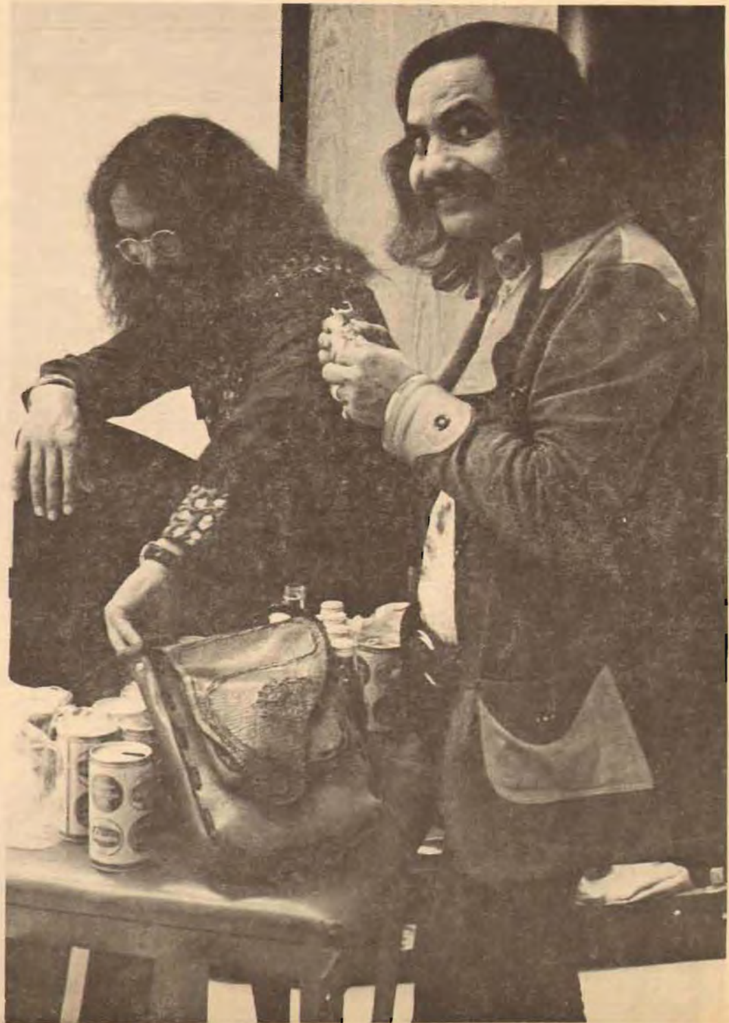
While Chong pensively enjoys a bite to eat, Cheech makes us wonder what's on his devilish mind.