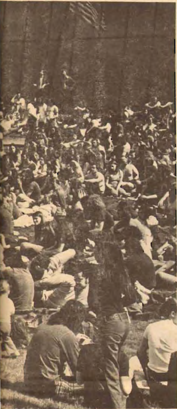
...ican flag, students and guests enjoy the open-air ...nd Cancer Society.