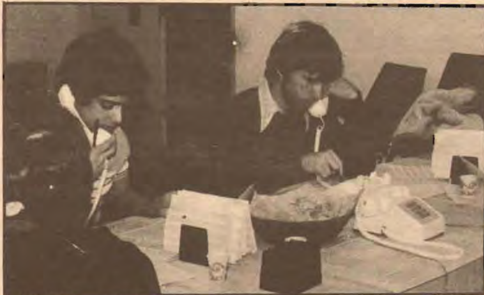
WJMF staff members were busy making calls last Monday in hopes of raising a portion of the funds needed to increase the station's power.

From the phonathon, WJMF received a recommitment on $1400 in outstanding pledges, and an additional $1000 in new