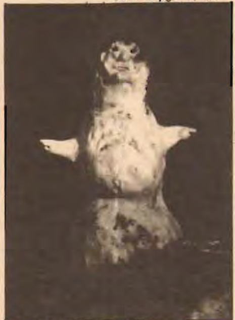
Does this person live in Dorm 12?