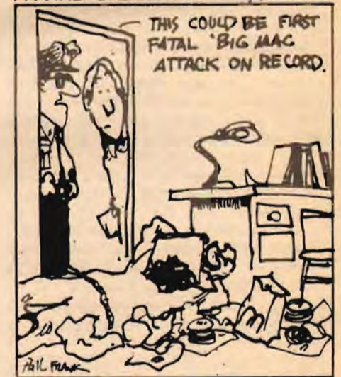
© COLLEGE MEDIA SERVICES box 4244 Berkeley, CA 94704