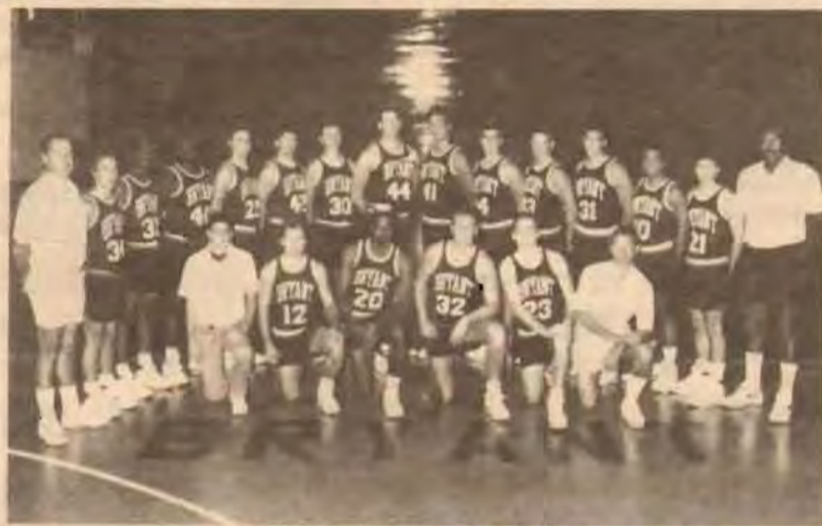
Bryant's 1988-89 Men's Basketball Team