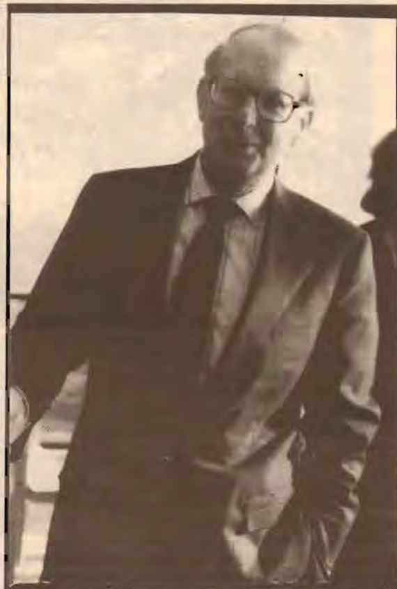
Archway Photo/ Michael Boyd