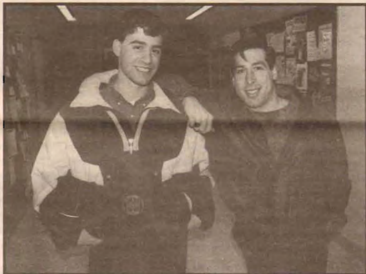
"We'll be getting away from each other!"