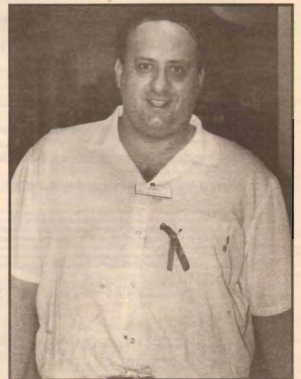
"I will travel from New York to Maine to watch trains - I'm a real fan!"