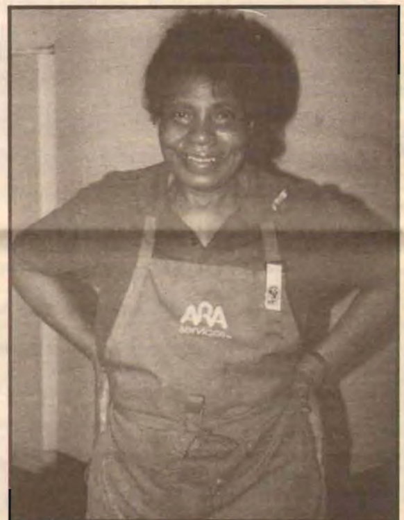
"I am going to Foxwoods and to Maine to eat some lobster."