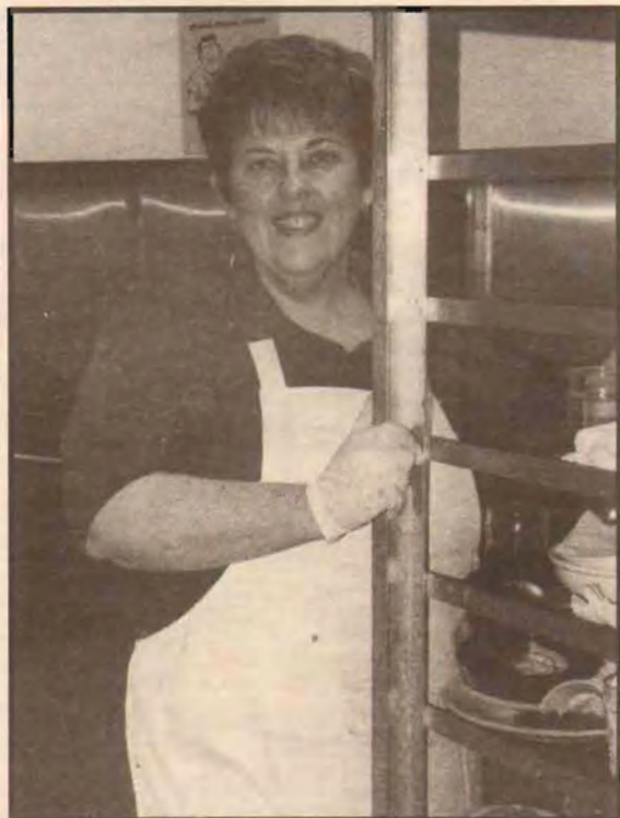
"I'll be working at my second job as a hairdresser and doing some shopping."