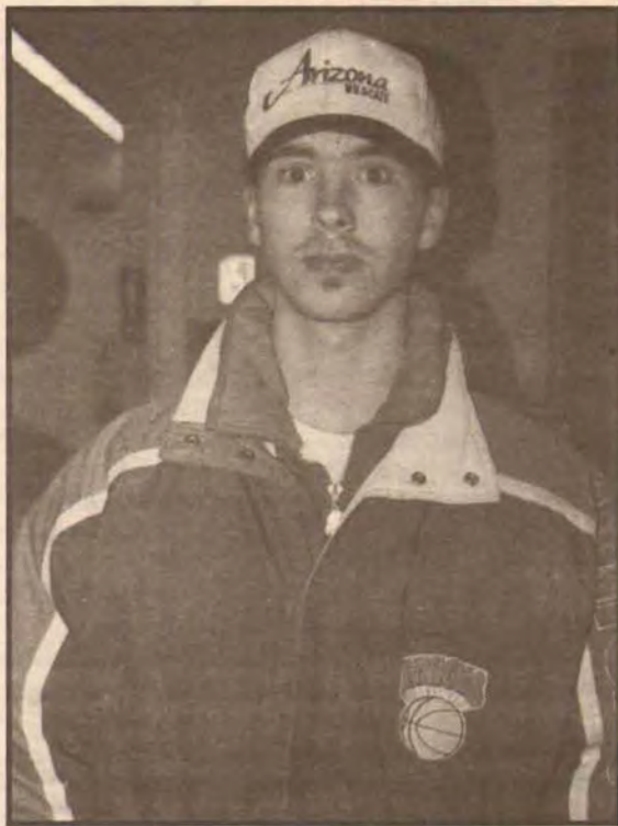
"I am going to Fort Meyers, Florida for the beginning of baseball season."