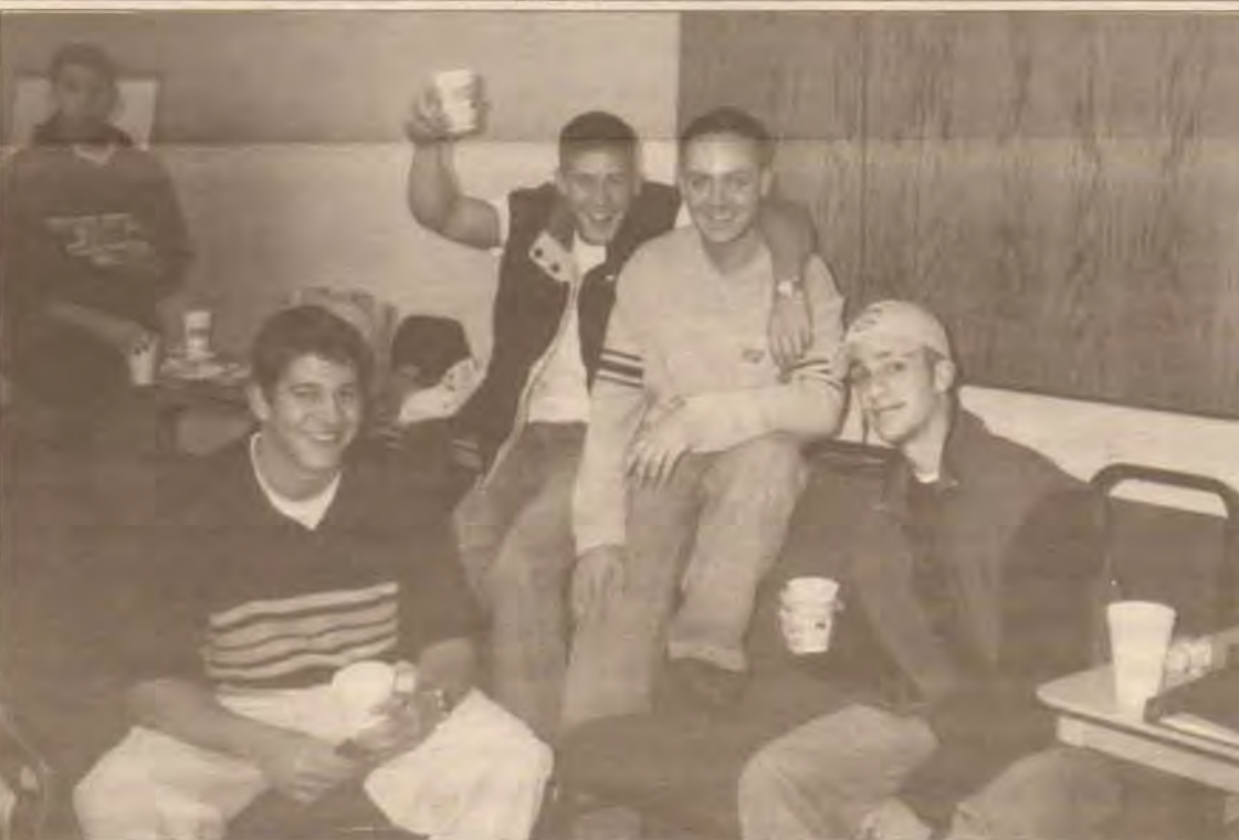
ABOVE: GQ Senators Having Breakfast at Senate Retreat BELOW: Senators at Wrights