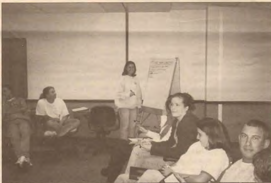
ABOVE: Senators Set their Goals at Retreat