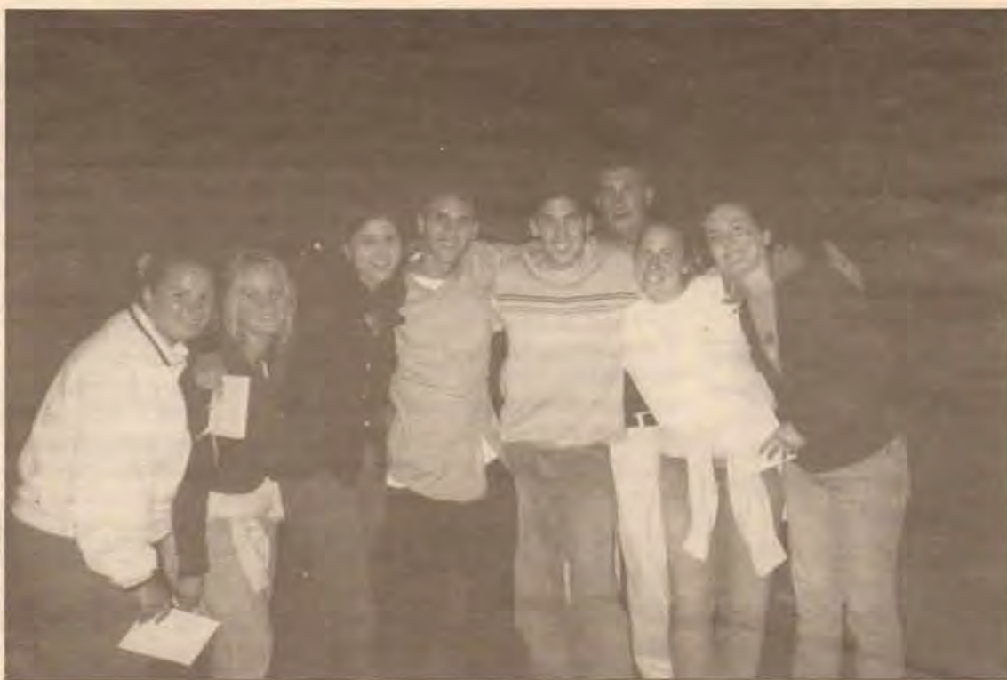
ABOVE: Senators having a blast at the Carnival

That's about it for now. We are always looking for help, so if you are interested in joining any one of our committees, or you would like to help out on a limited basis, contact the senate at senate@bryant.edu .