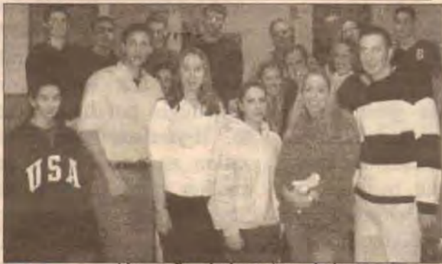
Above: Psychology Association

The Bryant Psychology Association welcomes all to attend: Mondays at 4pm in Nick's Place: Feb. 25 th , March 4 th , March 25 th , April 8 th , April 22 nd . http://web.bryant.edu/~psych/psystudents/psystudents_frame.html