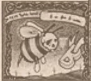
B Is for B-Sides is their latest album released in July of 2004.