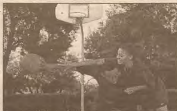
Quincy and Monica in the 2000 film Love and Basketball.

Madness to share some of the important lessons I have learned from love and basketball.