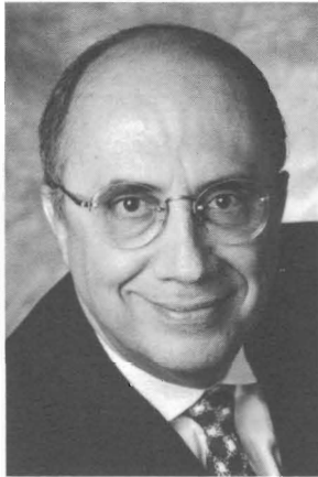
Henrique de Campos Meirelles

Owner and CEO of the New England Patriots; owner of Foxboro Stadium. In success story followed by millions of sports fans, Patriots won the American Football Conference championship in 1997, participating in the Super Bowl for only the second time in the franchise's history. President of Rand-Whitney Group and the International Forest Products Group of Companies that together comprise one of the largest privately owned paper and packaging companies in the nation. Chairs Chestnut Hill Management, money management firm specializing in equity management. From 1986 to 1991, major stockholder and president of WHDH-AM and WHDH-TV, CBS (Now NBC) television network affiliate in Boston. Attended Columbia University on academic scholarship and received fellowship to the Harvard School of Business where he earned M.B.A.