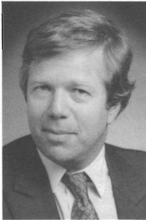
Robert K. Kraft