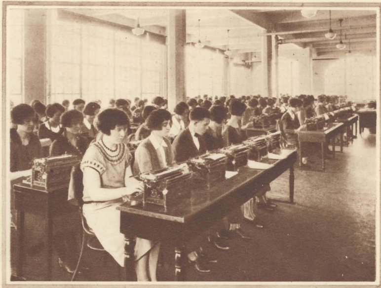
Section of the Typewriting Department, showing how ideal lighting and ventilating conditions prevail throughout the college home.

Education is capital to the poor man and interest to the rich man.