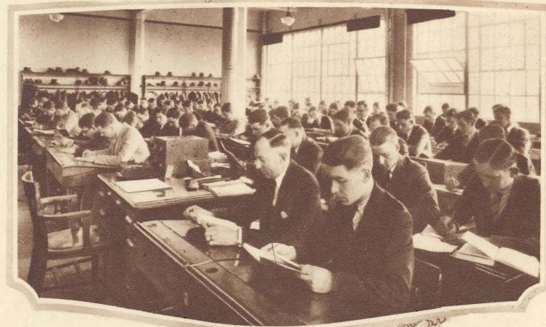
A Group of Students Studying Business Administration and Higher Accountancy.