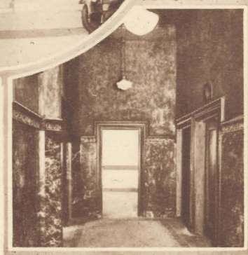
Main lobby containing high speed elevators which facilitate passage to upper floors