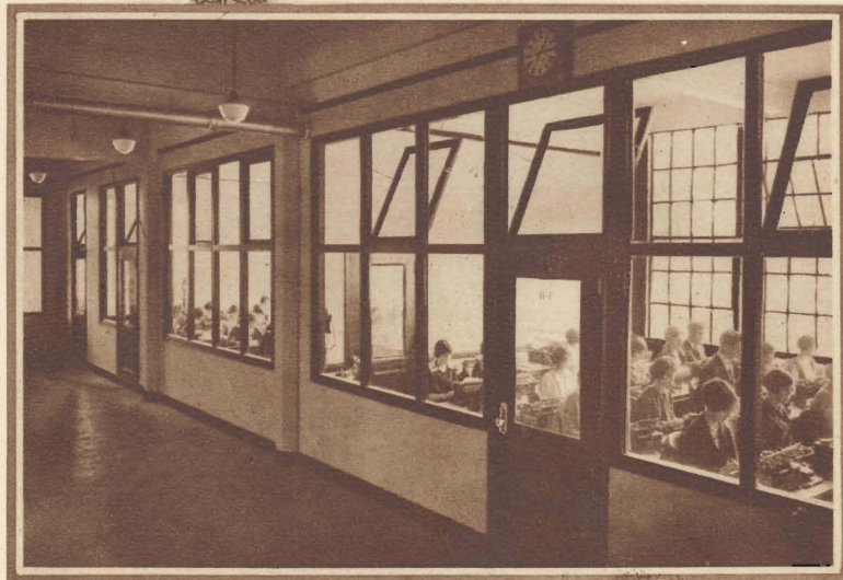
Interconnecting Class Rooms—Wide hallways facilitate movement of students from room to room.

The two preceding courses are joined in the Combined Bookkeeping-Stenographic Course which requires a somewhat longer time for completion, but affords satisfying results in increased opportunities and salaries. This course leads to a diploma.