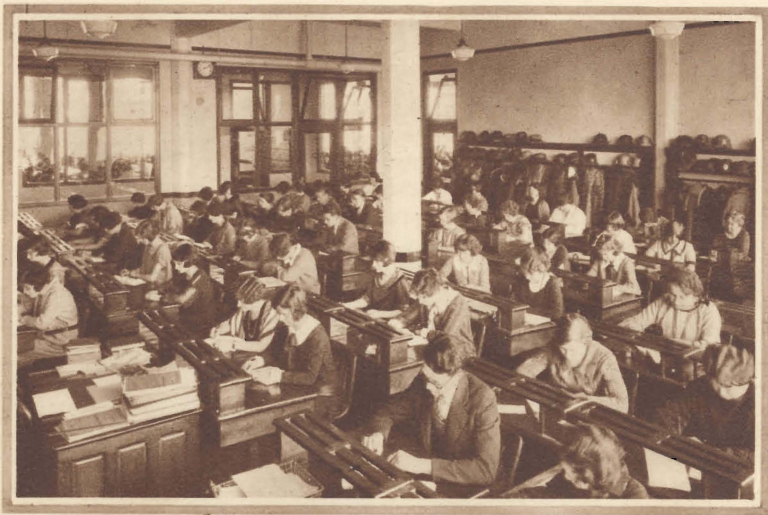
A Room For Secretarial and Commercial Teacher Training Students

Another outstanding feature is the ventilation. It is laborious to have to study in a stuffy room. But there are no drowsy, moping students at Bryant & Stratton with its unusual, fourteen-foot ceilings and its capacious study halls. The all-glass construction of the exterior of the building and the use of glass walls, with interconnecting transoms, even in the halls, affords a steady circulation of pure, fresh air without drafts, and insures alert brains and keen minds.