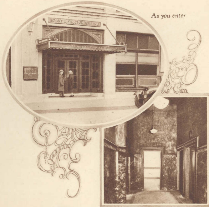
As you enter