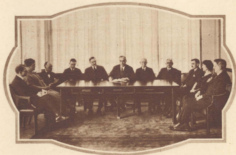
HEADS OF DEPARTMENTS ASSEMBLED IN THE PRESIDENT'S OFFICE FOR A REGULAR WEEKLY CONFERENCE

But natural light, to be sure, is not always available. Cloudy days and the needs of the Night Classes require other illumination. And here, again, that same desire for the best obtainable was gratified by having the competent engineers of the Westinghouse Lighting Laboratories, of New York City, come here to study the building and design the most efficient illumination system that could be had.