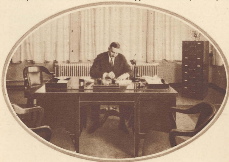
OFFICE OF THE VICE-PRESIDENT

Utility and Convenience, too, are as apparent as Beauty. For just