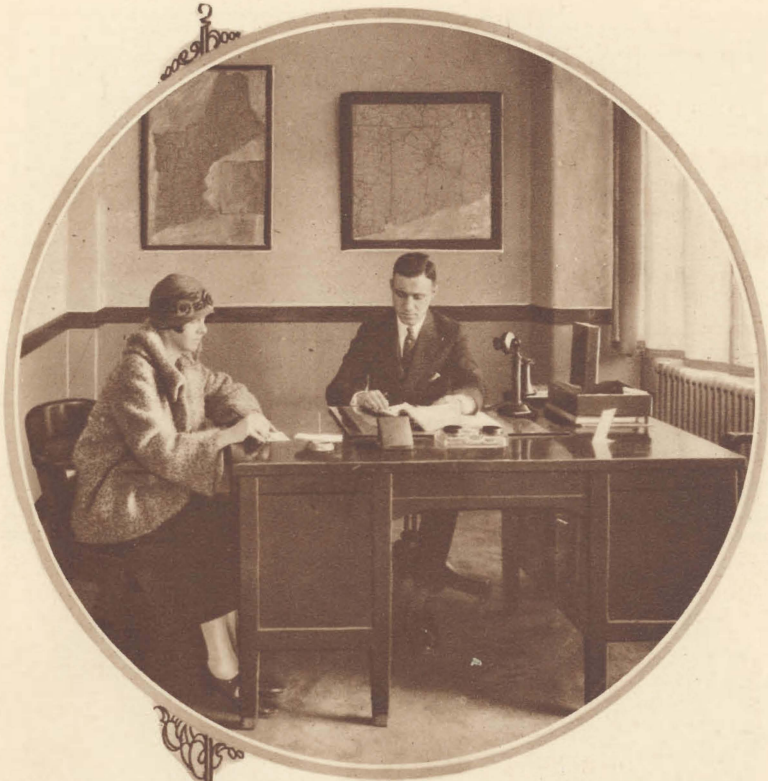
PLACEMENT BUREAU AND OFFICE OF THE SECRETARY Here more than one thousand calls for our graduates are received annually.

Shorter Business courses of elective subjects may also be pursued. These include special combinations of subjects, preparatory, and finishing courses. A certificate is granted for these courses showing the amount of work covered.