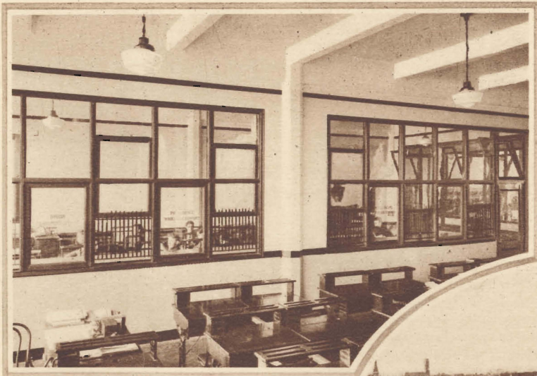
Laboratory of Business Practice showing Banks Wholesale Offices, etc.