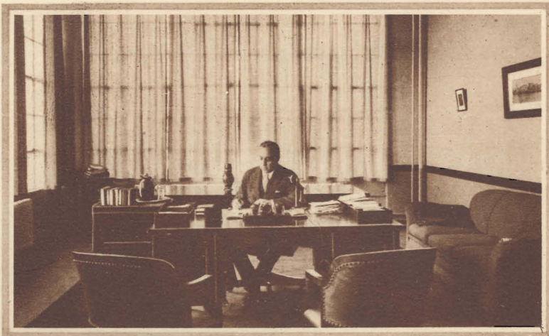
THE PRESIDENT'S OFFICE

This office opens directly into the main student lobby, making it easy access for students who come for personal consultation.