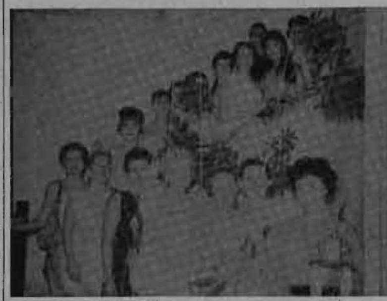
Gardner Hall girls pose in the costumes of ancient Rome with the Dorm Council Trophy.