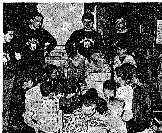
Santa Claus distributes gifts at BIB's Christmas Party.