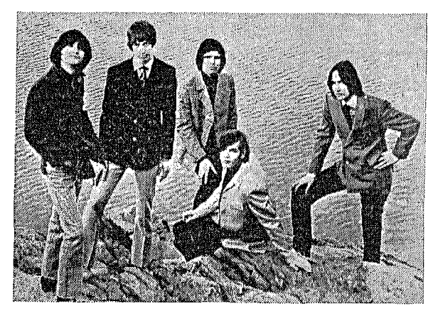
Featured on Saturday Night: Bringing to a grand climax the week long activities of the 1967 May Queen Pageant, the "Left Banke" will fill the Bryant Gym with great music and many unforgettable song hits.