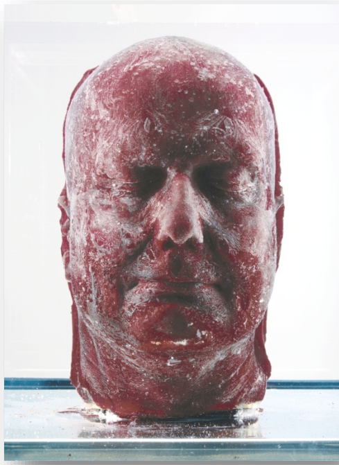
Figure 6: Self 2001. Marc Quinn

In Marc Quinn’s work, deliberate and conscious choices allow for viewer understanding. One of his projects that deals with intentionality and meaning, but also self criticism of the artist himself is the series Self . The series thus far