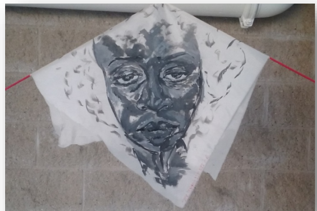
Figure 11: Masked Self Portrait 2016