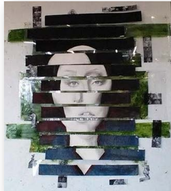
Figure 9: Deconstruction Lady Gaga 2013

Other works I have also done while a student here at Roger Williams is the Deconstruction series . In this series, I worked with famous artist such as Miley Cyrus, Erykah Badu, and Lady Gaga. With my first love being drawing, I wanted to complete a series involving influential people circulating in mass media. I am somewhat distant from the social media usage community, but I wanted to explore how I would approach these famous stars and my views on them. For example with Lady Gaga, I explored how far I was able to push a drawing including the personality of the individual being drawn. Gaga to me is a combination of multiple personalities and identity, which is confusing for many people, especially me. Therefore I deconstructed her image specifically to confuse the eye (See example figure 9).