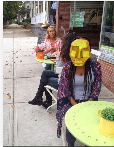
Figure 7: Masked Baes 2014

explaining his reason for such extremity and provocation he comments “It depends on my life to be created – it’s made from the substance of me; and so I think of it as the purest form of sculpture - to sculpt your own body, from your own body.” 9 Quinn wanted to move away from an average attempt to self-portraits, therefore instead he uses a culturally mediated approach by making use of his blood as a