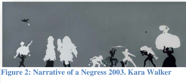
Figure 2: Narrative of a Negress 2003. Kara Walker

One of the main things that I appreciate about Kara Walker's work is her bold way of exploring identity and power relations in the world. In her work, Narrative of a Negress , She takes a social standing