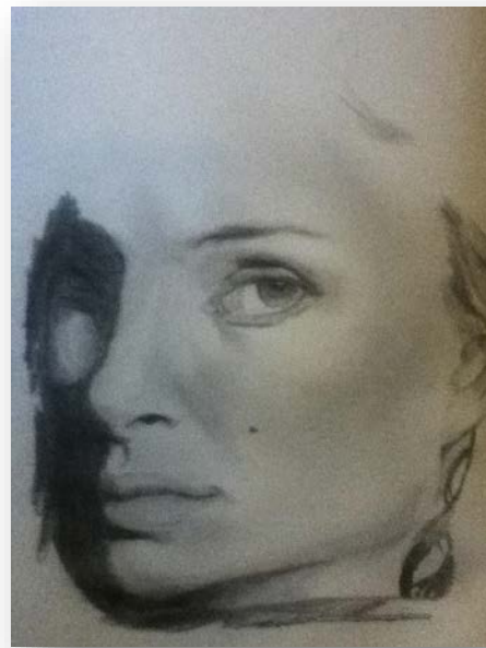
Figure 1: Natalie Portman 2012

Prior to attending Roger Williams, I was not exposed to art or what it meant to make art. Taking an art class at the end of my senior year in High School, I became interested in making art, mainly drawings of celebrities (See example figure 1). Starting undergraduate I was still deciding on a focus of study and did not expect to become a Visual Arts major. Through this major I started to question what constituted good or bad art and what is appropriate to say in my work. A statement made by one of my favorite artists is “You can declare yourself an artist and then figure out how to be an artist.” 1 Although I was not confident and didn't fully understand what it meant to be an artist, I knew that art was something that I cared about. Over time I have gained understanding that as an artist my goal is to start a conversation, a dialogue amongst people. Prioritizing discourse over other aspects of art making, I want these conversations to have an impact and widening on our daily lives and interactions.