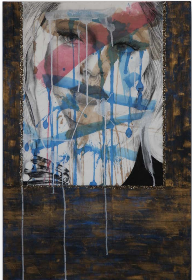
Figure 10: Deconstruction Kylie Jenner 2016

I continued working with the idea of wearing masks and how we chose to wear the masks we put on. I started to question; how much of the true self do we bring forward to others? What messages can be brought across by what we prevent people from seeing and what we feel comfortable revealing? I believe that a lot of the comforts we have when we present ourselves to the outside comes from masking, concealing, or manipulating the truth in a way. In simple terms, we pick and choose what we want others to see, but what if we didn't have that choice. What if everyone could see through the various facades and masks that we wear daily? My keys ideas are translucency and concealing, understanding identities through an object, and placing objective history and responsibility on others. As time passed, I focused more on the creation of the masks