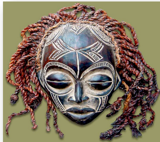
Figure 4: Tribal African Mask. Unknown

In most of my recent works, I have been playing with the subject of masks. Masks are usually referenced as artifacts from different cultures, example -from African culture . African masks have always been a source of inspiration in art of the past and in contemporary art. The act of masquerading and rituality come with the cultural understanding of masks. They have marked an expansion of time and stories.