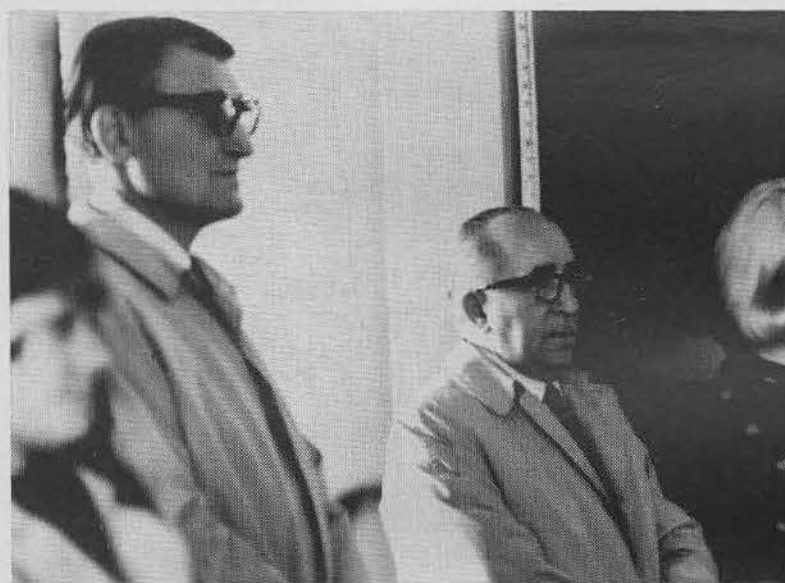
You take the right . . . and I'll take the left. . .