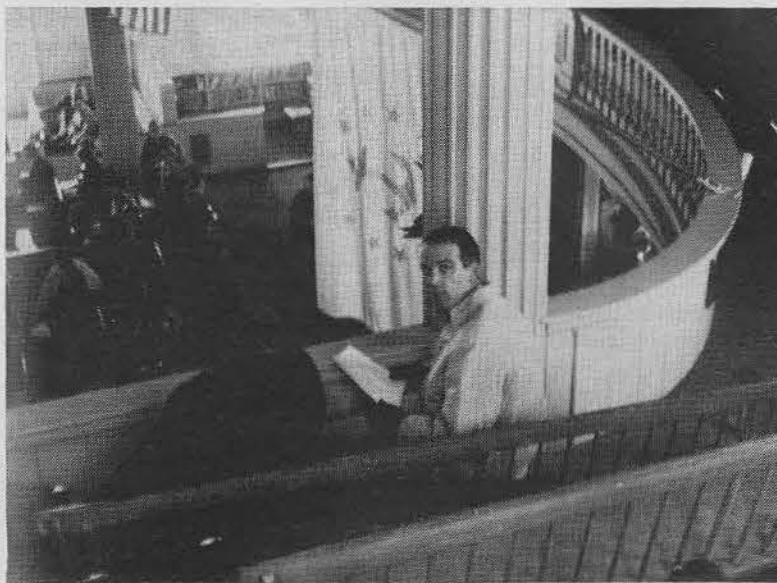
Hey! I thought I hold ya to scram kid!!