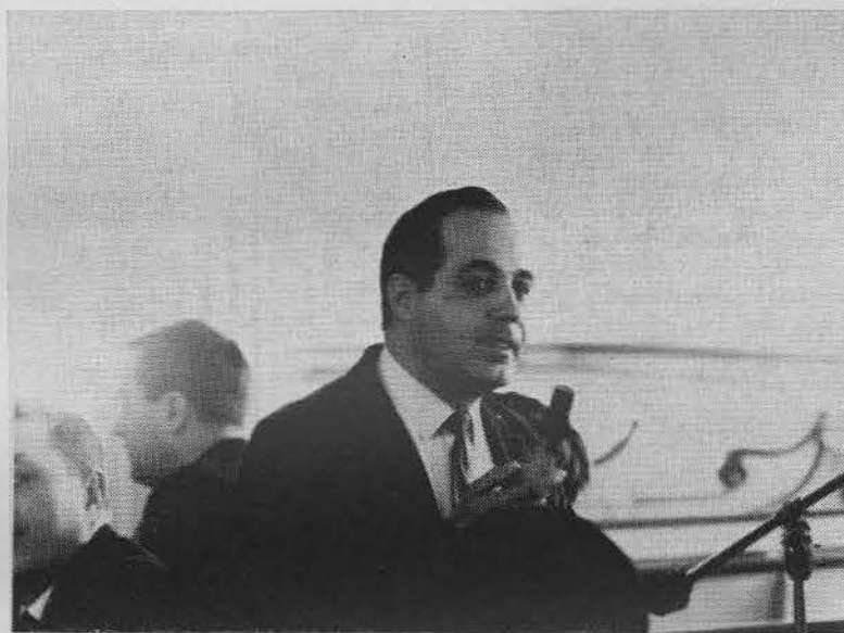
All right!! So I left my uppers at home . . .