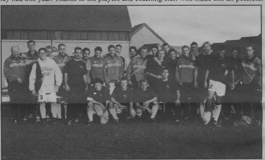
The 1999 Commonwealth Coast Conference champs

Despite losing in the first round, the Hawks had nothing to be sorry about. They had a truly amazing season in which they were rewarded with a championship and a first ever appearance in the Division III NCAA tournament. It was great to watch this team play and they provided us with many enjoyable weekends and weekdays on campus. With a majority of the team coming back next year, we can only hope for the same great season they had this year. Thanks to the players and coaching staff who made this all possible.