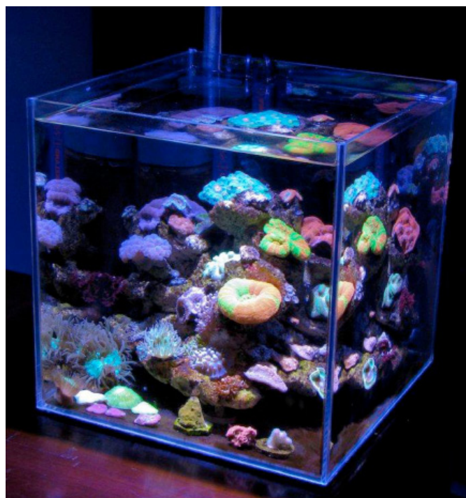
Figure 1. A nano-reef aquarium.

The second major factor affecting the aquarium industry is technology. Technological advances are well documented in the hobby magazines as reviewed by leading hobby experts in the topic of lighting (Riddle 2008; Joshi 2010) and filtration (Adams 2010) as well as the public aquarium community or professional hobbyists (Leewis & Janse 2008). Perhaps the most significant change in husbandry technology that affects the size and accessibility of coral reef tanks is lighting. Changes in aquarium lighting have allowed for an increase in the number of manufactures offering packaged mini or nano-reef aquarium system (Figure 1) that are directly marketed to consumers for reef aquariums. Advances in technology will affect various species differentially and therefore, if technology drives trade trends, then the different categories of traded animals should not be synchronous as expected if trade was dominated by a single causative agent (such as the global economy). Here, these two hypotheses were examined using data for imports of stony and live corals, as well as domestic fishery production from the state of Florida (invertebrates, live corals, marine fish, plants, sand dollars, and sand).