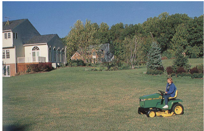
Figure 1. The idealized American urban landscape consists of lawns and garden patches around a single-family household. Maintaining this “dreamscape” requires many human management inputs including lawn mowing.

In the United States, over 80% of the total population—more than 250 million people—live in the urban, suburban and exurban landscapes that cover over 25% of the country's terrestrial surface; these numbers will likely increase well into the future (Brown et al. 2005; UN 2007). In urbanized landscapes, 79% of American households help manage over 128,000 km 2 of lawns and gardens—more area than covered by any single food crop—and thus contribute to a $147.8 billion landscaping industry (NGA 2004; Milesi et al. 2005; Hall et al. 2006). The magnitude of the urban landscaping endeavor and its associated green spaces have emerged from our collective pursuit of the American dream in which homeowners maintain idealized lawns and gardens around their homes to symbolize, in part, successful realization of this iconic vision (Figure 1; Jenkins 1994). Arguably then, the majority of Americans interact more today with lawns and gardens (conceptually, physically, and emotionally) than any other outdoor environments.