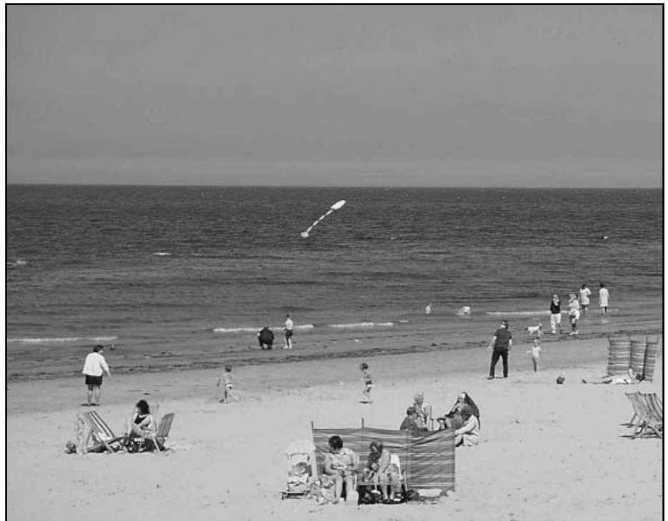
Photograph of public beach