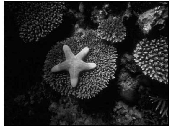
Photograph of starfish on coral formation courtesy of ©Nova Development Corps.

Citing an 1818 survey, the Georgia state legislature passed a resolution to restore the boundary line between Georgia and Tennessee to the 35th parallel. The current border runs below the Tennessee River and a shift would give Georgia a portion of the river. The resolution was passed in the wake of recent water rights issues in Georgia. If the Tennessee state government does not approve the change, Georgia could take its case to the United States Supreme Court.