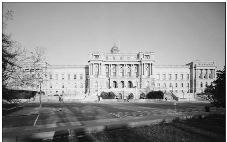
Photograph of west front of the Library of Congress