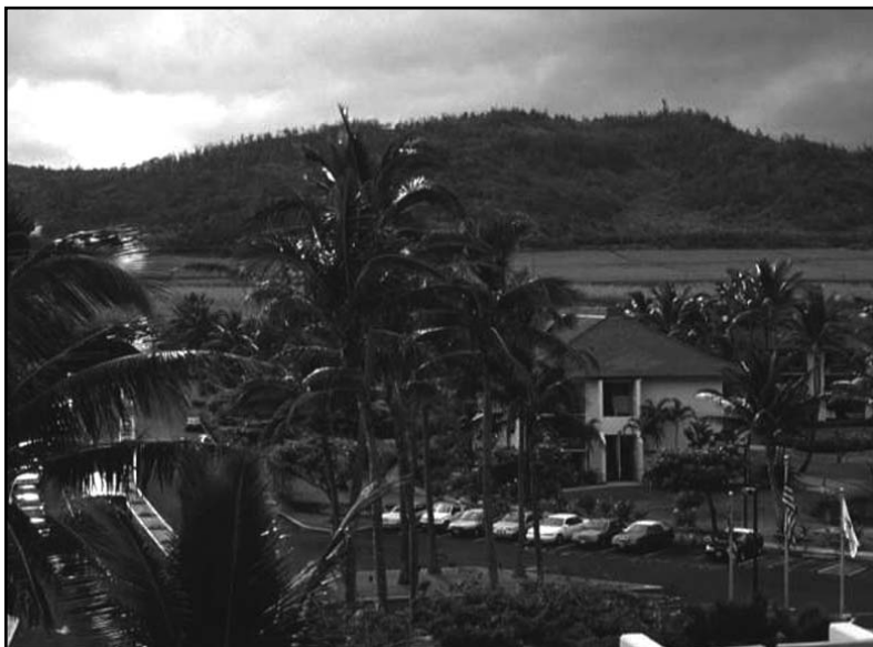
Photograph of Hawaii residential area

a helicopter to airlift the teenager back to its ship, which had the nearest hospital facility.