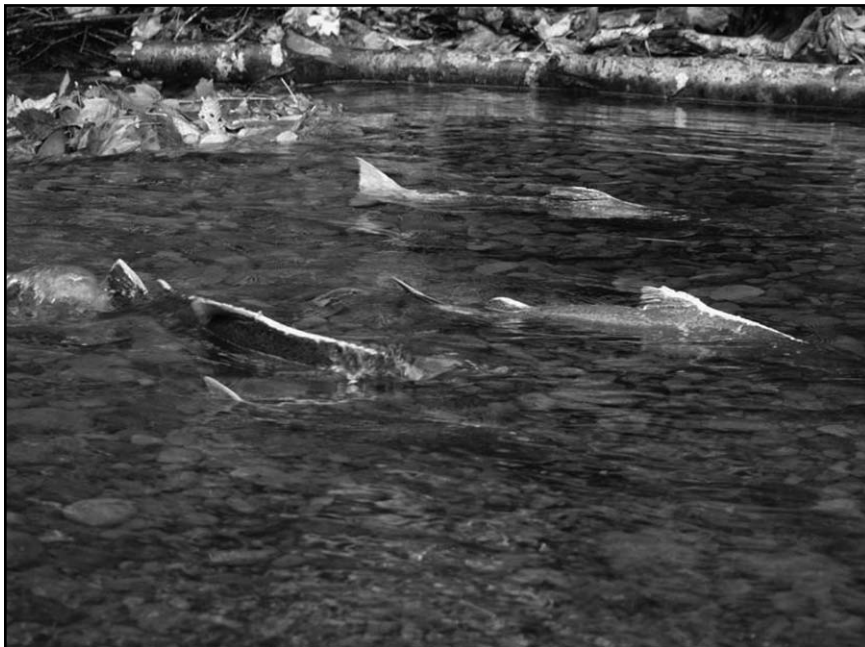
Photograph of steelhead trout courtesy of U.S. Fish and Wildlife Service.

In a recent case, Tulare Lake Basin Water Storage District v. United States , 2 the court of federal claims ruled that a regulatory restriction on the use of water should be treated as a per se physical taking. In the Casitas case, the United States argued that Tulare was decided incorrectly,