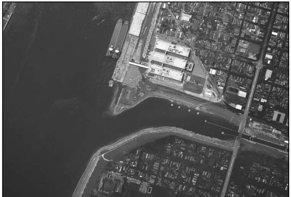
Photograph of industrial port courtesy of NOAA.