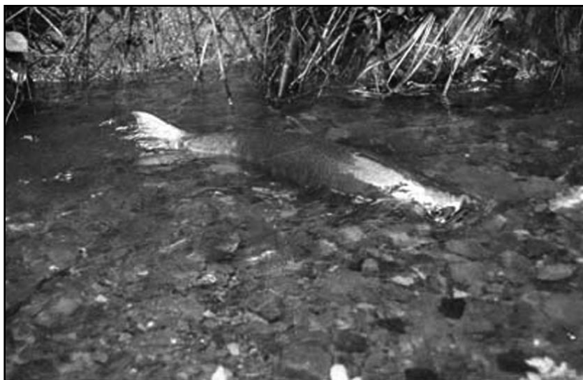
Photograph of spawning salmon courtesy of Marine Photobank and photographer Reuven Walder.