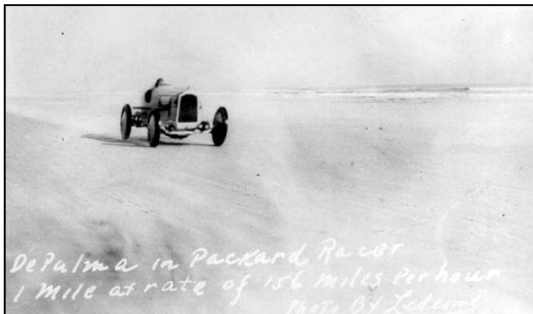
Photograph of Ralph DePalma driving in the sand in his Packard '905' Special in 1919

Next, the court looked at how a customary right is established. The court agreed with the plaintiffs that the elements of whether the use was ancient, reasonable, without interruption and free from dispute required a fact specific examination, which the trial court did not perform before granting summary judgment. Furthermore, the court found that although driving and parking were a customary use of some of the beaches, this did not include all of Volusia