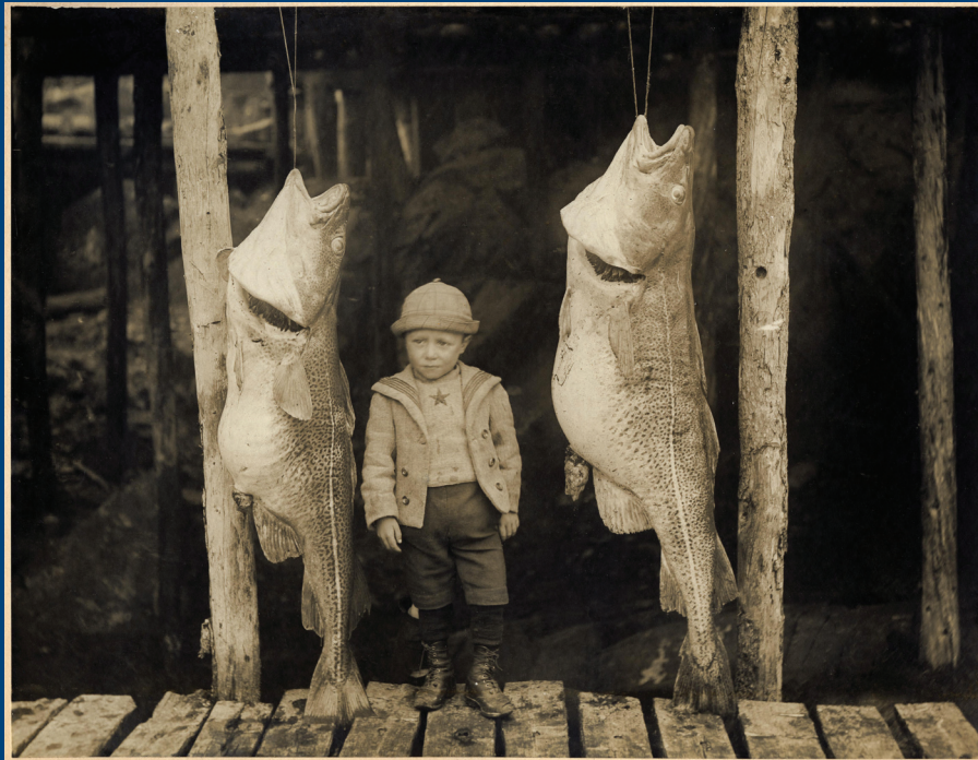
Labrador, 1900 “The larger fish measured 5 ft. 5 in., and weighed 60 lbs.”

ROGER WILLIAMS UNIVERSITY SCHOOL OF LAW BRISTOL, RHODE ISLAND