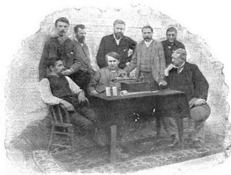
EDISON AND HIS CHIEF ASSISTANTS, 1889.