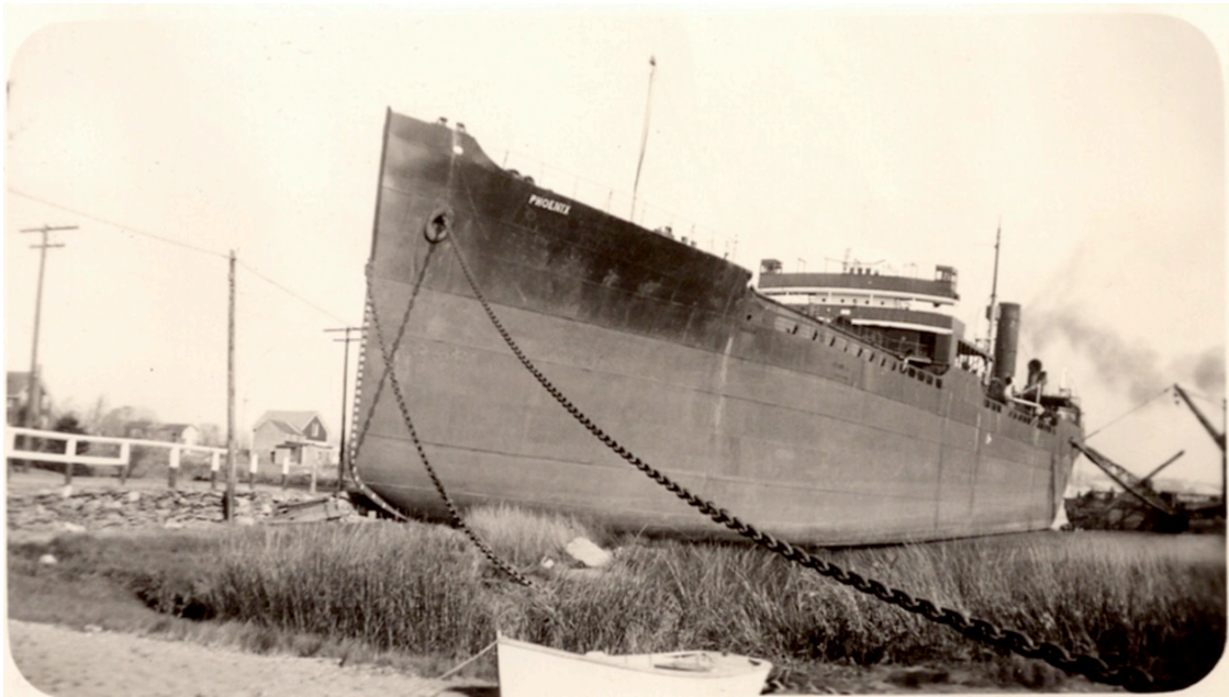
The tanker Phoenix loaded with 57,000 BBLS of gasoline driven ashore at Somerset, Massachusetts. Photo taken October 17, 1938.