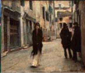
Street in Venice (1882) John Singer Sargent