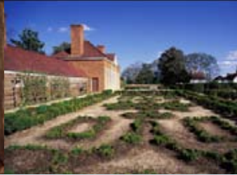
Mount Vernon Gardens, Mount Vernon, VA Architect: George Washington