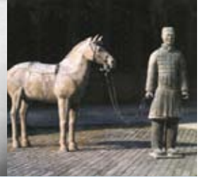
Calvaryman, from the tomb of Emperor Qin (221-207 BCE)/Artist: Unknown

The Visual Resources Center (VRC) at Roger Williams University is a collection of slides and digital images that are available for faculty and student use. The VRC is located within the Architecture Library in the School of Art, Architecture, and Historic Preservation. The content of the collection is available to the entire university community. Although the collection is comprised mostly of art history and architecture images, the Visual Resources Center welcomes requests for new images with any subject matter appropriate to the curriculum of the university.