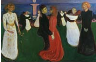
The Dance of Life (1899-1900) Edvard Munch