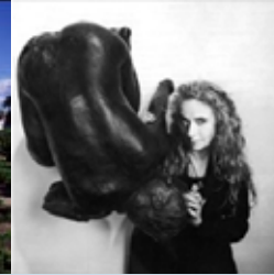
Kiki Smith with "Lilith" (1994)