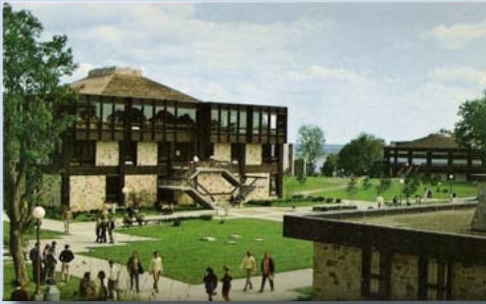
Postcard depicting the Main Library in the 1970s, from the University Archives.