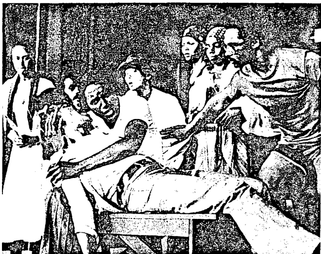
A black ensemble group performs with support from the National Endowment for the Arts.

certain amateur oral history projects in which individuals record their experiences. One mentioned in a New York Times article involved people chronologically listing their favorite songs and junk foods during their lifetimes.