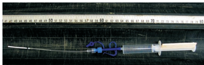
Figure 1. A Rhizon MOM 5-cm soil sampler with tube connector and syringe propped open with a wooden spacer

A full appreciation of sedimentary manganese spikes requires complementary dissolved Mn^{2+} profiles (e.g., Burdige and Gieskes, 1983; Wallace et al., 1988), however, the requisite pore water sampling to generate such a profile presented a challenge for Expedition 302. Preservation of continuous core was desired to address first priority expedition objectives. Construction of an appropriately