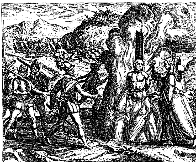
BARTOLOMÉ DE LAS CASAS AT EXECUTION OF INDIAN CHIEFTAIN IN CUBA

In a written statement to The Chronicle , the N.E.H. chairman, Lynne V. Cheney, said: "The endowment is not hostile to critical inquiry into any subject or cul-