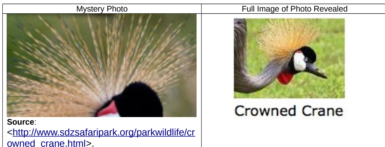
Figure 4: Partial and full images of a crowned crane used in Mystery Photo Activity.

youngest learners to question, wonder, and think more deeply about things. One activity I often use with students is something called Mystery Photos, like the one shown in the left side of Figure 4. To play the game, ask students to look at the photo and think about what the image might be. Then, think about what evidence in the picture makes them think that. After students have time to talk about their educated guesses, they can visit a website like Jigzone, where they can put together a puzzle of this mystery photo and discover the answer to “What is this?” all by themselves. When they finish the interactive puzzle, they learn that the image is the top part of a crowned crane (see the right side of Figure 4 and the completed puzzle at < http://www.jigzone.com/puzzles/C3055D567D1B >).