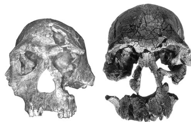
Fig. 1 Both found in the early 1970s at sites at Koobi Fora, Kenya, these skulls, from left to right, of H. habilis (KNM-ER 1813) and H. rudolfensis (KNM-ER 1470) represent the variation in size exhibited by early Homo .

(Fig. 1)—are restricted to East and South Africa. However, H. erectus , which diverged from H. habilis around 1.8 million years ago, marks the first hominin to disperse outside of Africa. Between about 1.9 and 1.8 million years ago, there is evidence for geographic and temporal overlap of all three early Homo species in East Africa.