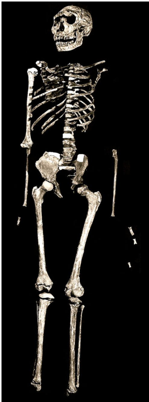
Fig. 4 The nearly complete skeleton of a young H. erectus , KNM-WT 15000, known as the “Nariokotome boy” and also the “Turkana boy” was discovered by Kamoya Kimeu on the west side of Lake Turkana, Kenya (across the water from Koobi Fora) in the early 1980s.

With larger bodies, larger brains, and smaller teeth, most H. erectus fossils are distinct from the other two species of early Homo . H. erectus teeth are smaller than H. habilis and H. rudolfensis , and although the early specimens have large teeth, tooth size decreases through time in the species. The upper incisors of many specimens are shovel-shaped, and this is seen in some modern humans.