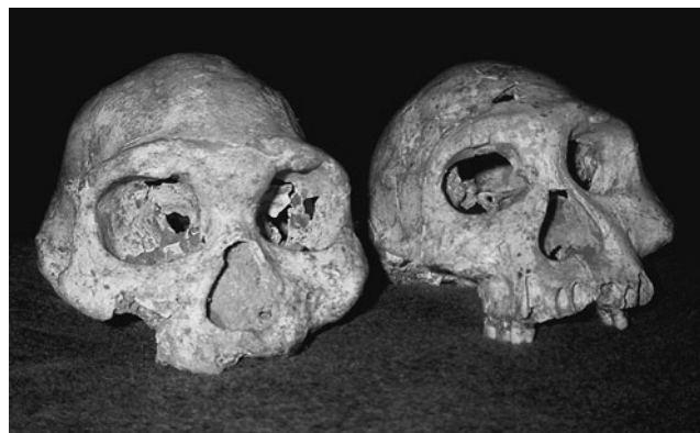
Fig. 6 Two of the excellently preserved skulls discovered at the early Pleistocene site of Dmanisi, Georgia. D 3444 is on the left and D 2700 is on the right.