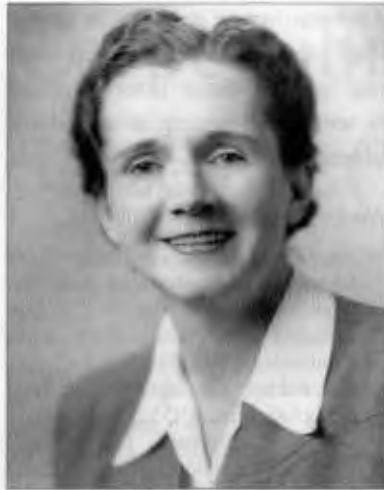
Rachel Carson, 1940.

Carson’s work confronted the linkages between powerful chemical companies and governmental agencies. Despite suffering from the last stages of metastasizing cancer, Carson continued to speak publicly about her work. She asked the US government to investigate the results of its spraying projects and to use less destructive meth-