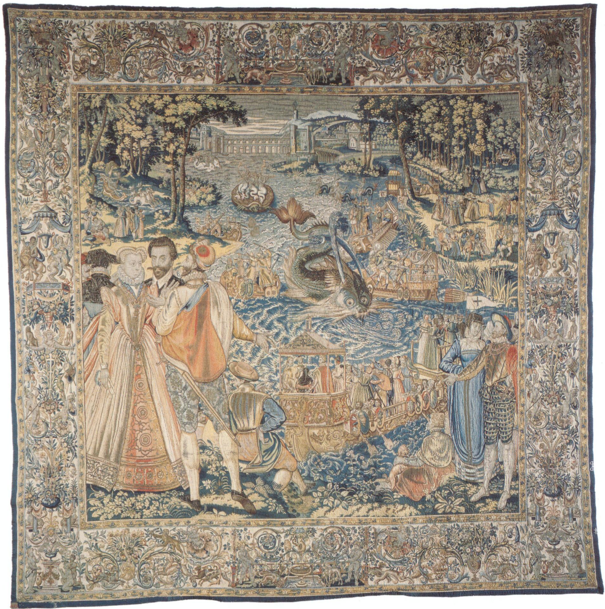
FIGURE 4 Fête nautique sur l'Adour (Whale) . Brussels tapestry, unidentified atelier, c. 1575. Wool, silk, gold, and silver, 355 x 394 cm.