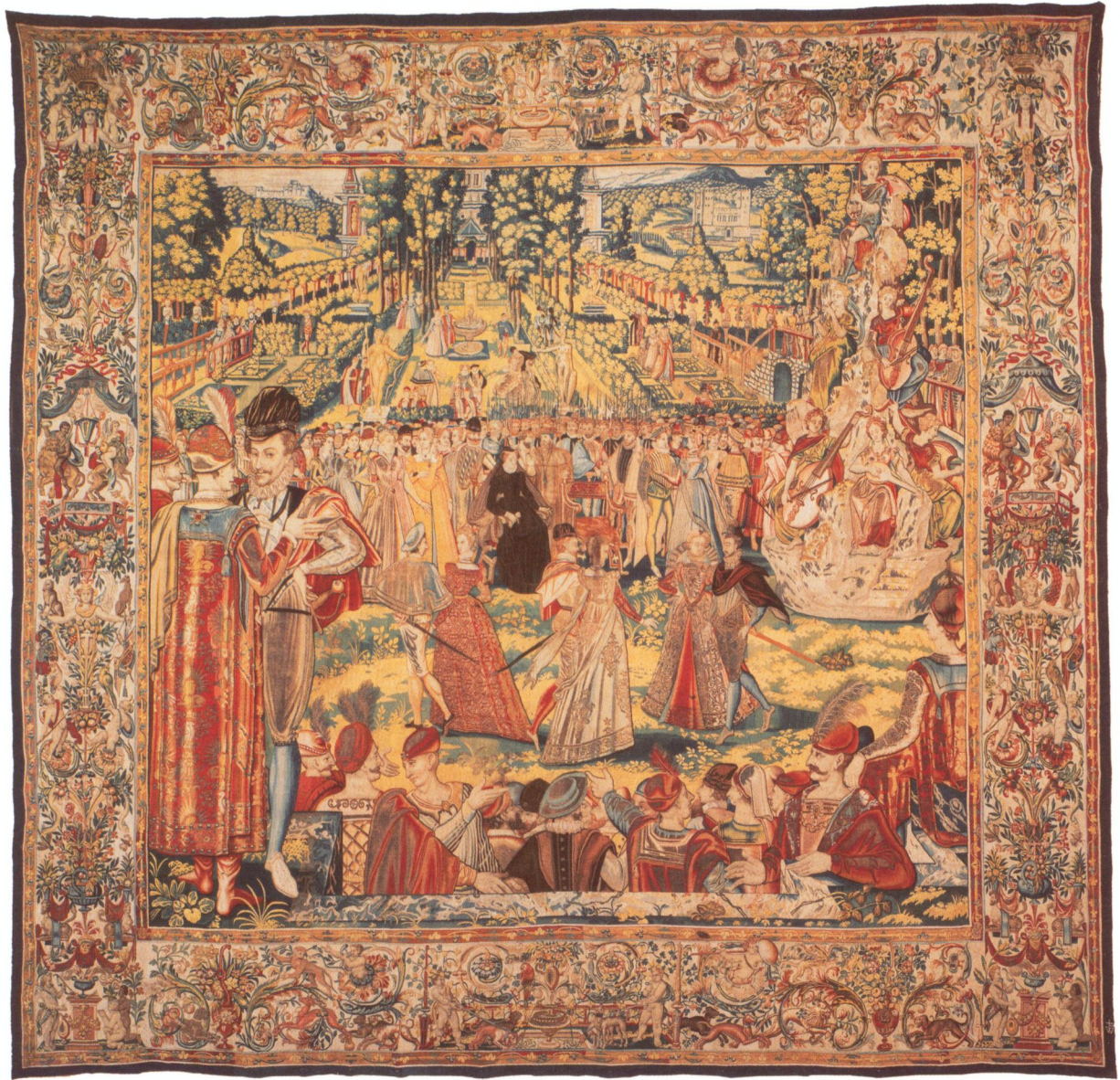
FIGURE 7 Fête aux Tuileries en l'honneur des ambassadeurs polonais (Polish Ambassadors) . Brussels tapestry, unidentified atelier, c. 1575. Wool, silk, gold, and silver, 388 x 480 cm.

Platonic values and taught the princes how to hold court. 33 Under the guise of representing festivals from the previous reign, the queen mother made clear that she still held the reins of power during the 1575-1576 truce in the wars of religion. The series therefore offers a double image of Catherine de Médicis and her family: the first, demonstrating the supernatural and atemporal nature of the Valois dynasty; the second, showing the harmony, concord, and peace that the queen mother sought her