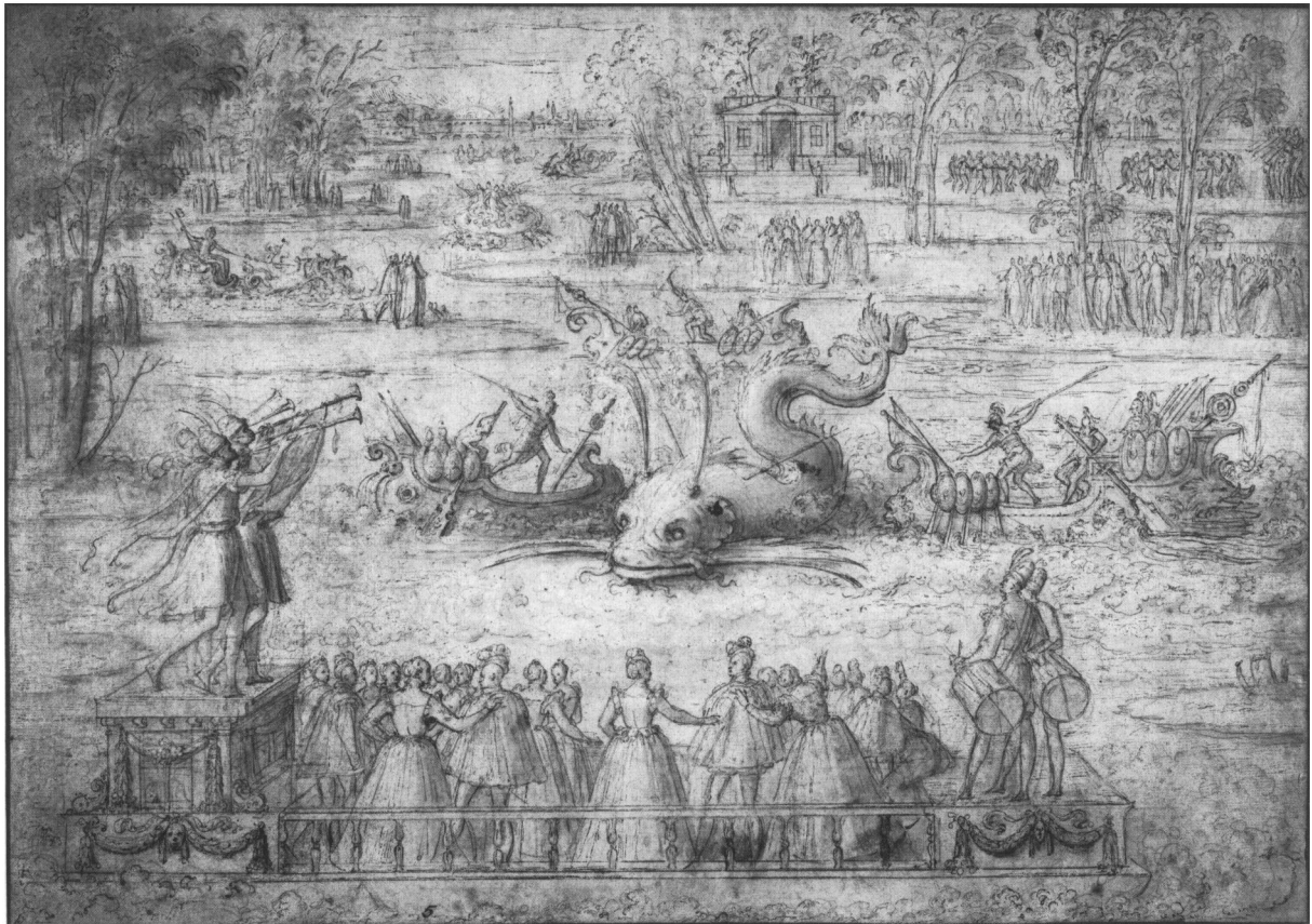
FIGURE 10 Antoine Caron, The Water Festival at Bayonne, June 24, 1565 (Whale) , Paris, 1570-1574. Black and brown ink, and some black ink, gray-brown wash, white heightening, on paper, 34.9 x 49.3 cm. Pierpont Morgan Library, Dept. of Drawings and Prints, New York.

but is it really the painter's emblem? The complicated question of attribution goes beyond the scope of this paper, which is focused on the meaning of the Valois tapestries, but it seems necessary at least to raise it, even if for the moment another name is not proposed. In any case, it would be better to return the work to an anonymous author rather than to persist in a highly debatable attribution.