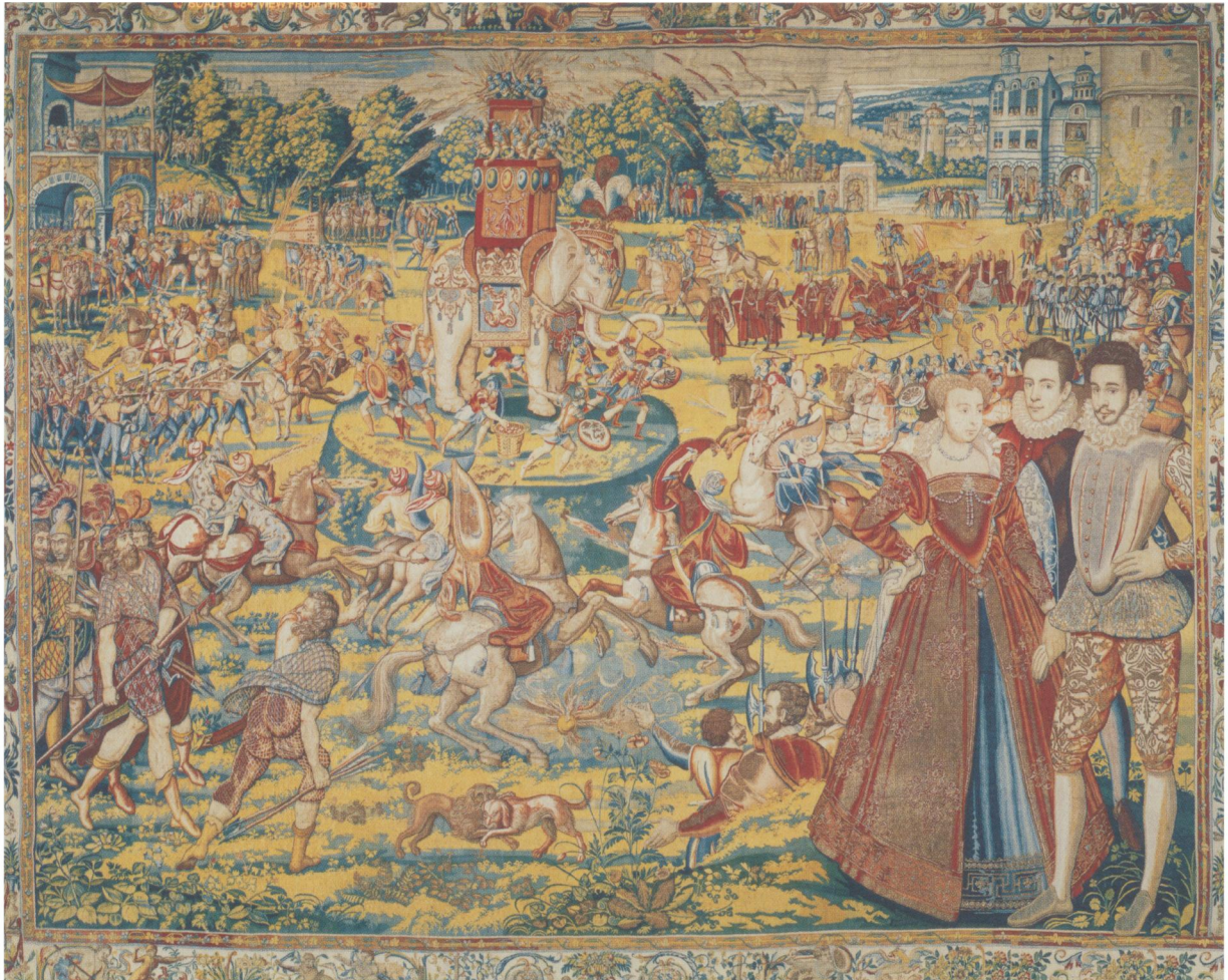
FIGURE 5 Mascarade à l'éléphant (Elephant) . Brussels tapestry, unidentified atelier, c. 1575. Wool, silk, gold, and silver, 387 x 670 cm.