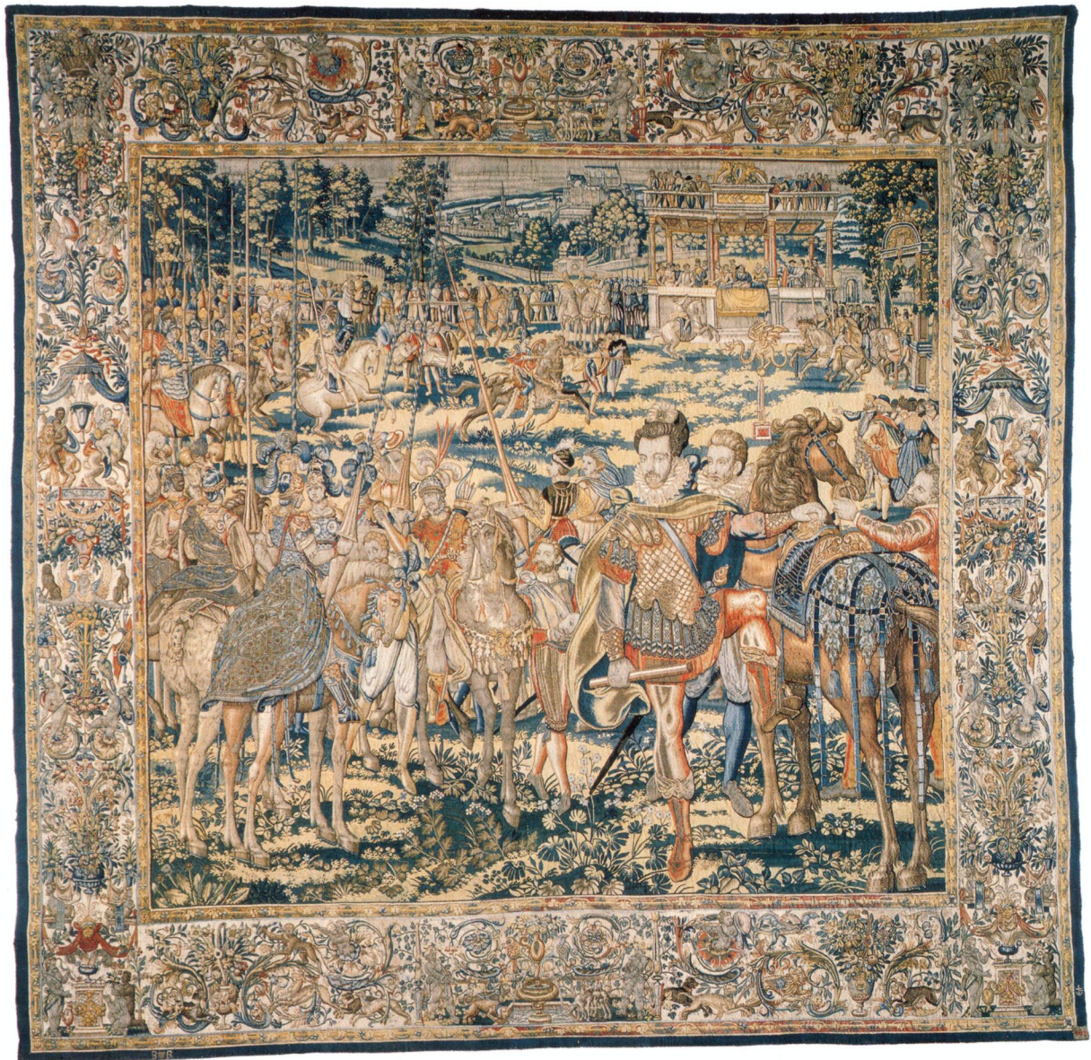
FIGURE 2 Jeu de la quintaine (Quintain). Brussels tapestry, unidentified atelier, c. 1575. Wool, silk, gold, and silver, 387 x 400 cm.

queen mother, who had no equal other than “her great uncle Pope Leo and Lord Lorenzo the Magnificent,” according to Pierre de Bourdeilles de Brantôme. 10 Three of these scenes evoke the festivities at Bayonne in 1565, marking the end of the grand tour of France taken by Catherine and her young son Charles IX, after their meeting with her older